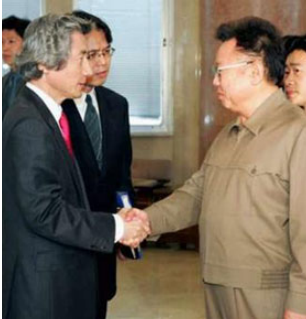
Koizumi and Kim Jong Il

But that was only the beginning of the story. It turned out that there were several true narratives. And the story of Charles Robert Jenkins and his family was one of them.