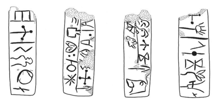
Figure 6.2 CHIC #113 MA/P Hh (07) 02, 4-sided bar with linear text, with two sides showing ruled lines of text