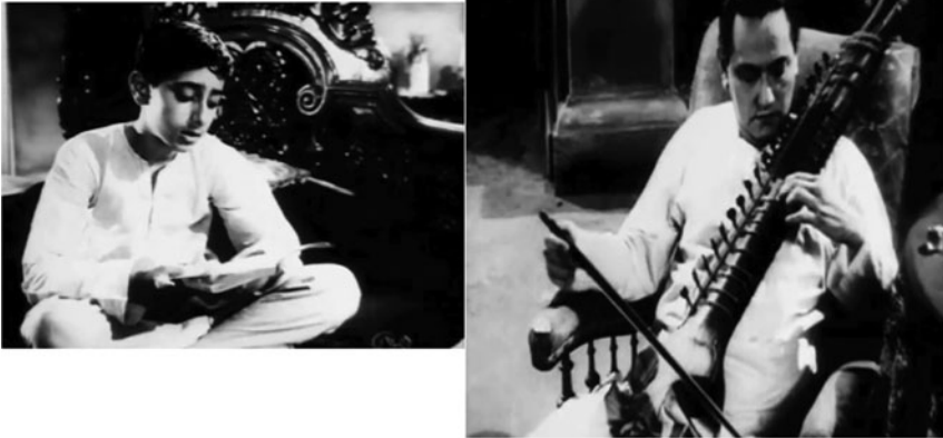
Figure 8. Jalsaghar : father tutoring son in music.

as he did with Khoka's corpse. He cries out for Ananta, who rushes to his side and assures that dawn has arrived.