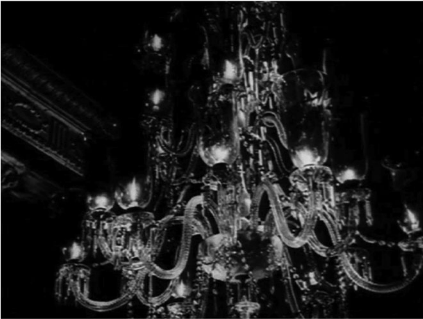
Figure 7. Jalsaghar : the chandelier—luminous and musical lineage.

is especially attentive when his father's portrait is painted) and being tutored in music by Roy himself (see Figure 8). Khoka learned to ride the elephant and his father's horse; in the original short story, we are told that the Roy household once had many stables of horses. At one point, Mahamaya complained that Khoka has inherited his father's obsessions with the arts and with riding, to the point of neglecting his studies. Roy explained that the son must indeed inherit—learn—these things, in order to embody the lineage and properly rule over the palace and estate when his time comes. There can be no compromising when it comes to nurturing Khoka's noble character (including horse-riding) or aesthetic and spiritual edification.