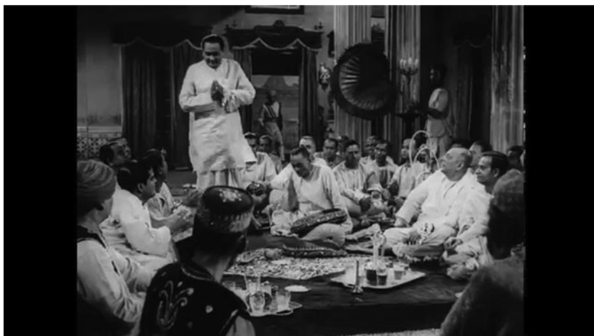
Figure 3. Jalsaghar : the host of noble lineage—a soiree at the House of Roy.

fanning makes the experience more regal as well as more comfortable (see Figure 3).