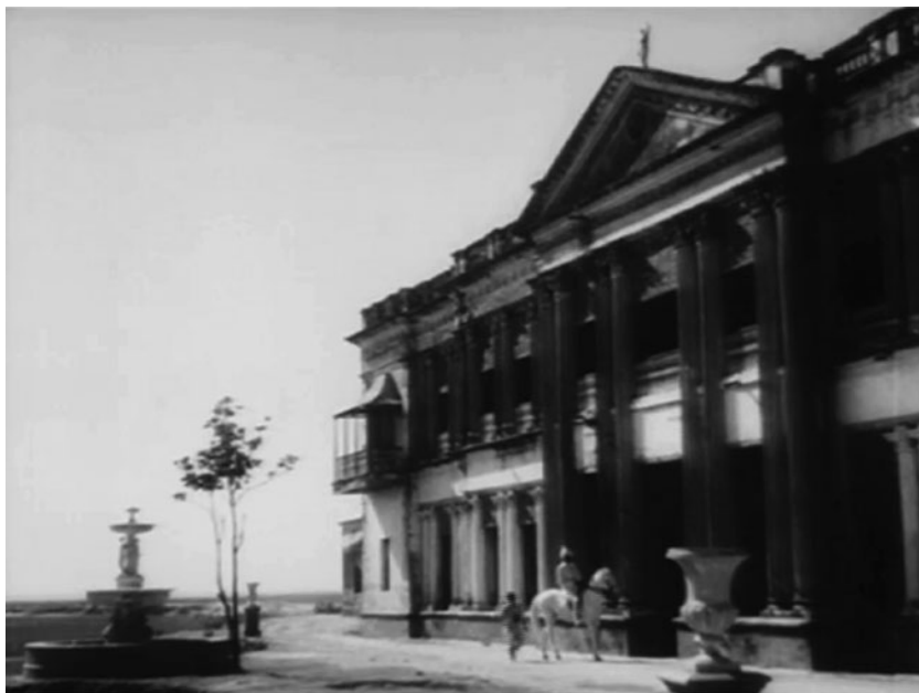
Figure 2. Jalsaghar : Lord Roy arrives at his splendid palace, with fountain in front.

identifies which specific musician is playing the shenai . Ganguly, we will learn, is an entrepreneurial parvenu—at least from the perspective of Lord Roy and also, arguably, from the perspective of director Ray.