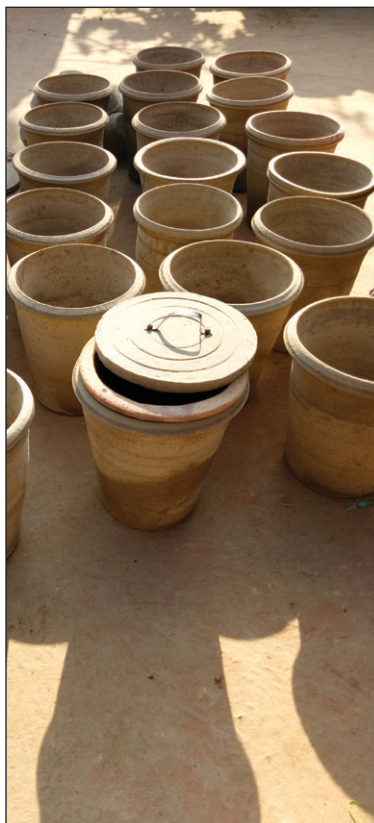
Left: A potter at Tindivanam in Tamil Nadu on June 10–11, 2017. Right: A field-made G-filter.

Originally posted to the blog, Materials Connect , published under the auspices of MRS Bulletin .