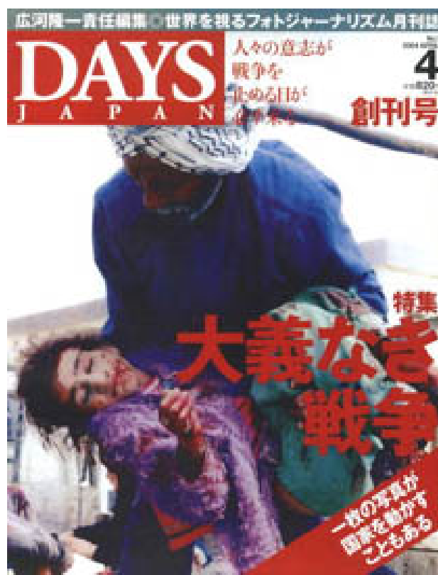
The cover of DAYS Japan , inaugural issue (April 4, 2004).

of pain and sadness coming from the Iraqi people, and the footsteps of war that are approaching Japan? The plaintiffs and the attorney before you can hear them clearly. We have brought this lawsuit with the urgent desire of stopping this development. It is truly a shame that the court has not admitted the testimony of witnesses and Plaintiffs, but the Plaintiffs have submitted extensive documentary evidence. We ask that the court read all the documentary evidence and take the time to confront, in silence, this photograph of a bloodstained girl. And please do not hand down a decision along the lines of the Kofu District Court decision, as argued by the State. That self-abnegating decision might as well be deemed a suicidal act on the part of the Court.