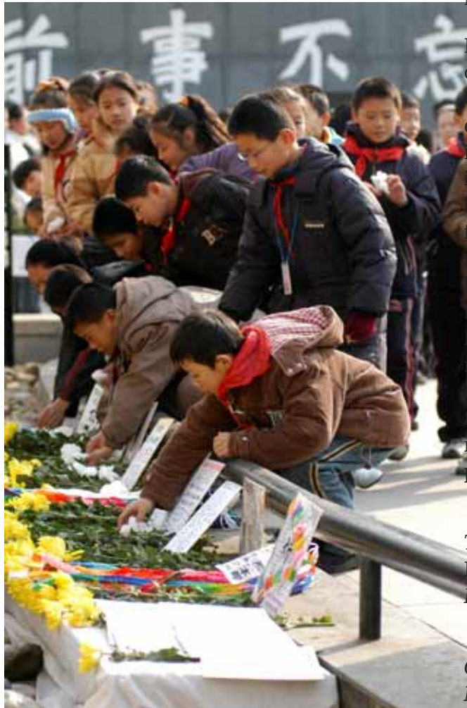
Chinese students place flowers in front of a monument for victims during a gathering marking the 68th anniversary of the Nanjing