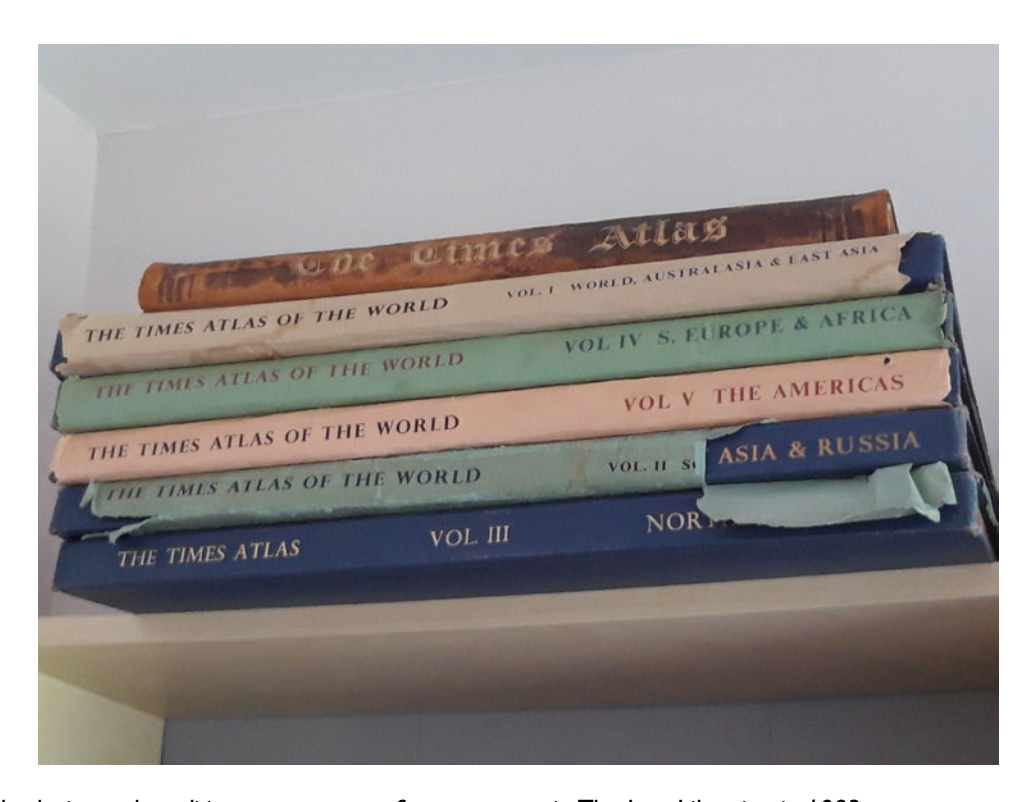
Keeping old books in good condition was a matter of great concern in The Law Librarian in 1983

The lead article in the final edition of 1983 outlines how the Denning Law Library at the University of Buckingham was embracing new technology by developing a