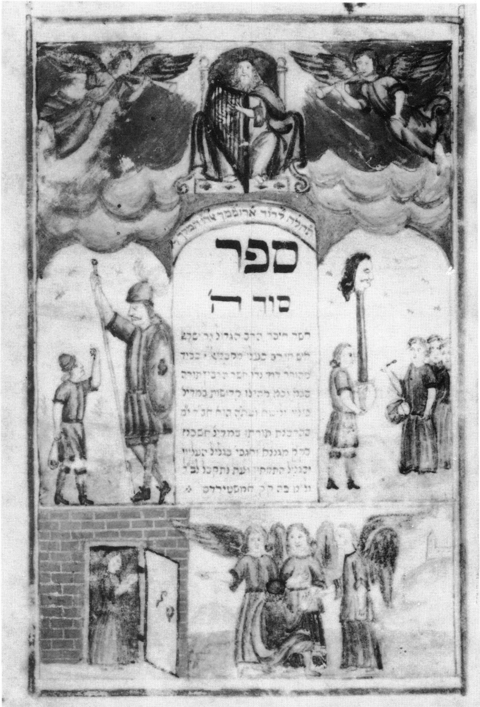
Plate 1. Hebrew Ms. A4, title-page. Wellcome Institute Library, London.