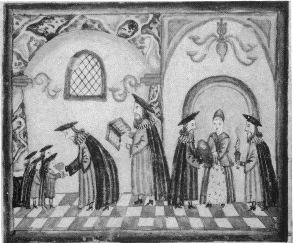
Plate 3. Hebrew Ms. A4, f. 11v.