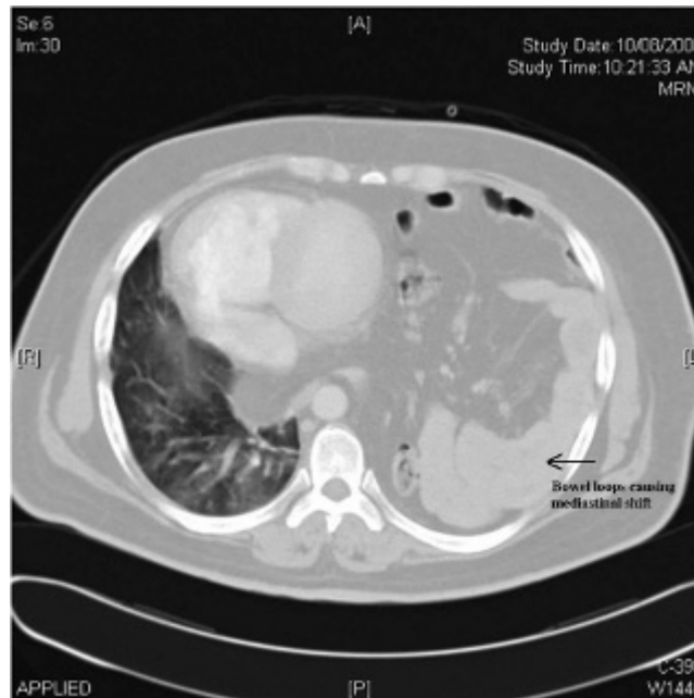
Figure 2. Herniation of bowel loops and mesentery with shift of mediastinum to the left and near-collapse of the left lung.

Diagnosis may be straightforward when plain chest films show the presence of bowels in the thorax. They have been misinterpreted as pleural effusion in several case reports, as in our patient. 5,6 In such circumstances, thoracentesis or needle aspiration performed blindly may puncture the abdominal contents in the thorax. If in doubt, insertion of a nasogastric tube that reveals intrathoracic positioning of the stomach may confirm the diagnosis. Further evaluation with CT or magnetic