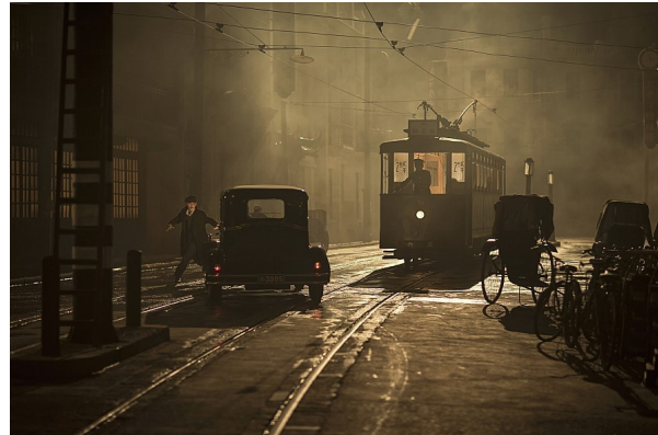
A still from the Shanghai set in Assassination .

colonies, for example in the eerie dens of Shanghai, the nighttime street scene after An Ok-yun and her team arrive in a chilly Seoul, and the emerald and gold brilliance of the Mitsukoshi department store, site of the lavish wedding turned gratuitous gunfight later in the film.