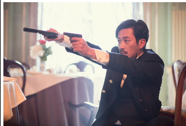
Hawaii Pistol (Ha Chōng-u), in Assassination.

out, attempt lone-gunner rescues, survive large explosions or multiple gunshot wounds, and maintain disguises despite unnervingly close calls. Borrowing heavily from Hollywood gangster and detective films, the spectacular violence renders the confrontation with colonial power through sporadic shooting sprees or bombing attacks and not a day-to-day struggle involving thousands of ordinary colonial subjects. One particularly distasteful scene set in a crowded Seoul Station in The Age of Shadows has Kim U-chin (Kong Yu) fire a pistol round point blank through the face of an oncoming Japanese soldier and into the head of a second standing directly in the line of fire.