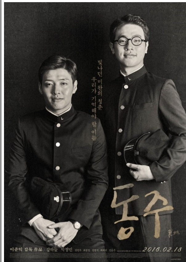
Promotional poster for Tongju .

case, my selection of these four blockbusters is not intended to be entirely representative of South Korea’s collective memory of the colonial period. Instead, I understand these action dramas as one prominent tendency, given their commercial success and circulation, within the vast and complex terrain of historical memory available to representation, one which surely raises the stakes of recollecting the past.