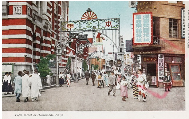
Color postcard of a commercial street in Honmachi, Keijō. Compare with fig. 1. left.