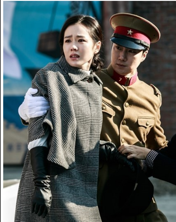
Chang-han (Pak Hae-il) escorting Princess Dōkhye (Son Ye-jin) to safety, in The Last Princess .

with the dirt-smeared clothes and faces of these workers – are contained and inoculated by the Korean emperor-system, ideologically presupposing that such factory exploitation would not come from Korean bosses.