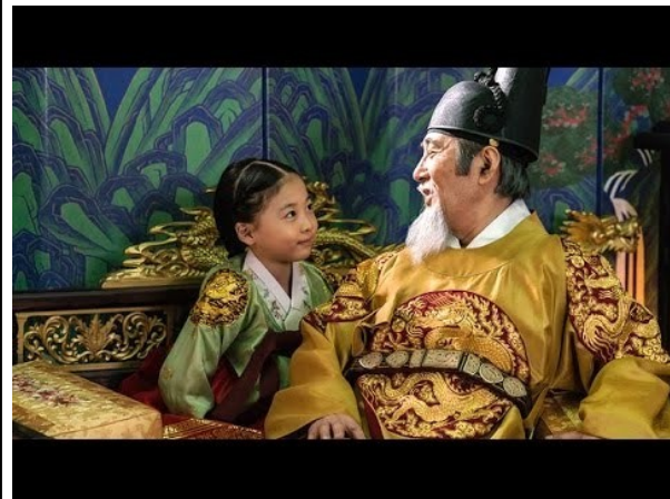
A young Princess Dōkhye (Shin Rin-a) with her father, Emperor Gojong (Paek Yun-sik), in The Last Princess .

With an unbroken linear trajectory moving from the Provisional Government to the present Republic of Korea operative in these films, only a limited, state authorized historical connection is established with the colonial period. On the popular level, no such correlation can be made beyond the auspices of the provisional government. To reiterate why finding such a correlation is necessary, the reader will recall my claim at the outset that the Cold War division of the Korean peninsula risks naturalization if the historical continuities between the colonial period and after are denied. If only an officially sanctioned connection is permitted, Cold War South Korea becomes the teleological culmination of a very limited faction within the Korean independence movement which scarcely conveys its true plurality and diversity of opinions and strategies. According to this teleological view, the militant tactics employed in the movement are no longer warranted after independence. Militant resistance is only recuperated by these contemporary films because it can be subsumed retroactively, via the aforementioned teleology, within the contemporary state's "monopoly on the legitimate use of force," as Weber would say. The logic of violence in these