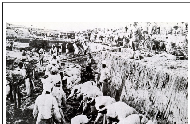
Colonial Korean labor under Japanese supervision.

locomotive, and automobile. One could do a frame-by-frame comparison between, say, the city streets and Japanese/South Korean militaries treated in Modern Boy and Pak Sujin's Ode to My Father (Kukjae sijang, 2014), respectively, to illustrate the contiguous underlying sensibilities between contemporary blockbuster films treating the colonial period and postliberation South Korea. This presents a curious “return of the repressed,” as it were, insofar as a certain continuity with the colonial period – which I have been claiming is otherwise denied in these films – becomes apparent on the level of consumer culture, exhibiting the same commitment to capitalist development (minus explicit reference to its concomitant inequalities) shared by the Japanese colonial project and the postliberation South Korean state. That these two may possibly share the same draconian approaches to governmentality, however, is inadmissible; hence the abandonment of this cultural or economic continuity on the level of politics as represented explicitly in the films. But the superficial manner in which the Japanese colonial project is taboo in these films should be sufficient to trouble any easy conflation of the Cold War division system and true democracy or liberation.