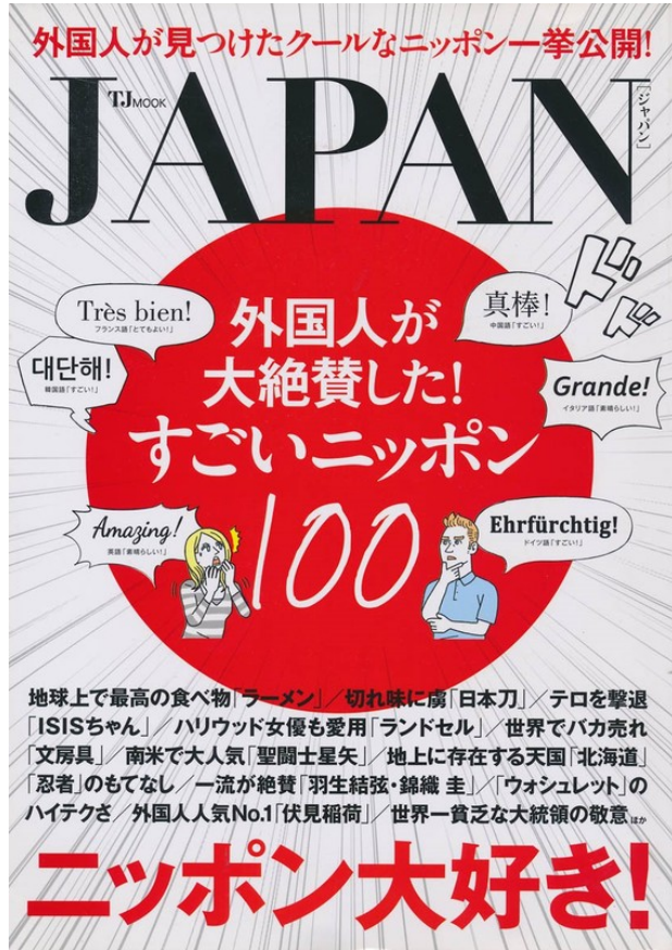
JAPAN: Rave Reviews by Foreigners! Great Japan 100 (Takarajimasha 2015)