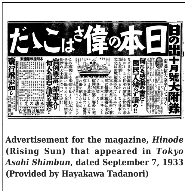
Advertisement for the magazine, Hinode (Rising Sun) that appeared in Tokyo Asahi Shimbun, dated September 7, 1933

Look at these thrilling facts! Japanese must wake up to the awareness of being number one in the world, and all the nation's people must unite and stand on the grand world arena.