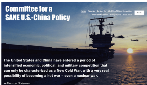
An image from the homepage of The Committee for a SANE U.S.-China Policy