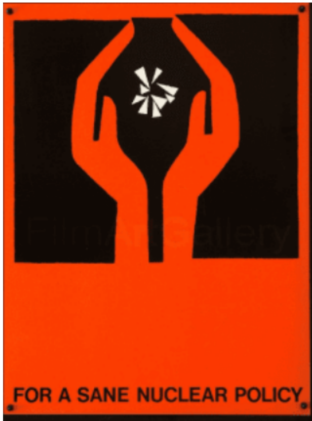
Handbill for original SANE group.

The new committee derives its name from the now-defunct National Committee for a SANE nuclear policy , an organization advocating for nuclear disarmament that was co-founded in 1957 by Norman Cousins, the editor of The Saturday Review who brought survivors of the atomic attacks on Hiroshima and Nagasaki to the U.S. for medical treatment.