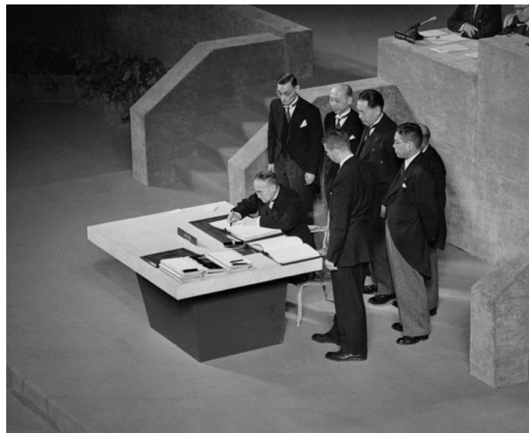
The Signing of the San Francisco Peace Treaty

The San Francisco Peace Treaty is an international agreement that in significant ways shaped the post-World War II international order in East Asia. With its associated security arrangements, it laid the foundation for the regional structure of Cold War confrontation: the “San Francisco System,” fully reflected the policy priorities of the peace conference’s host nation, the United States (Hara 1999, 517-518).