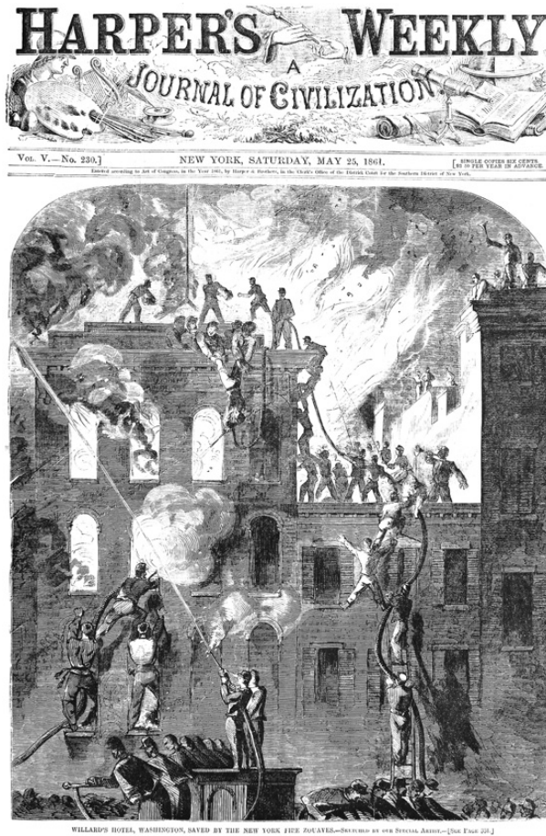
FIGURE 1.2 “Willard’s Hotel Saved by the New York Fire Zouaves.”

New York Times contended, should “retrieve the character of the regiment from the disgrace cast upon [them] by the excesses of the few rogues who have been turned out of its ranks.” It was a “disgrace,” Wisner lamented, “which was very unjustly cast upon it in consequences of the habit of some newspapers have of exaggerating and magnifying small offences into grave outrages.” 115