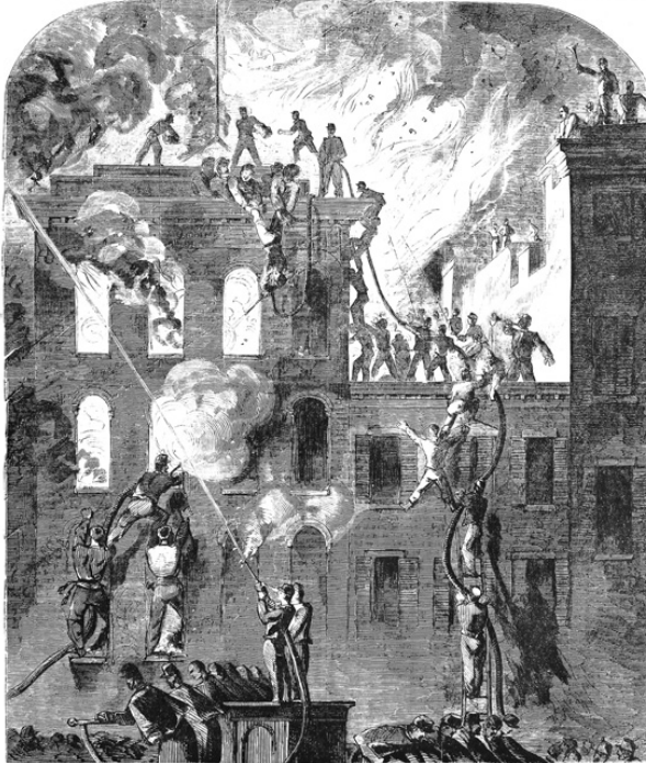
WILLARD'S HOTEL, WASHINGTON, SAVED BY THE NEW YORK FIRE ZOUAVES—DRAWING BY ONE SPECIAL AGENT.—[See Page 20.]