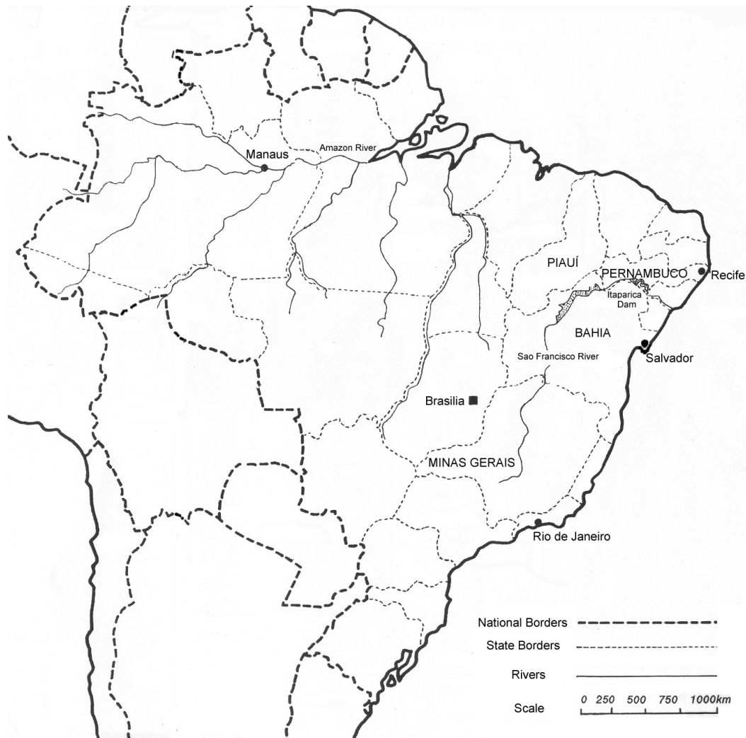
Figure 1 Map of the Itaparica Dam location in the São Francisco River valley, NE Brazil, 520 km from the city of Salvador (Bahia State) and 450 km west of the city of Recife (Pernambuco State) (adapted from Portella 1992).

where the charcoal samples were found and the anthropogenic artifacts found in the surrounding area. Some of the fireplace charcoal samples were selected and used for dating the sites presented here. Facilities at the Laboratory of Nuclear Geophysics at the Federal University of Bahia, which includes a combustion and purification line, a decay counting system, and mass spectrometers Nuclide 3-60-RMS and Finnigan Deltaplus, were used in the present study. This facility has been widely used since the 1970s for dating groundwater, carbonates, organic matter, and other materials of interest to experts in geophysics, especially for studies in geochronology, paleoclimatology, and recently for oil pollution characterization. Despite the fact that archaeological dating is not the main focus of this facility, in conjunction with the archaeologists that worked in the rescue project, a limited but very relevant number of samples to date have been determined.