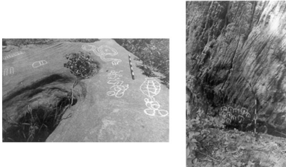
Figure 4 Photos of the archaeological sites Bebedouro das Pedras (left) and Pedra da Moeda (right), located in Rodelas (see Figure 2), showing the panels with petroglyphs that characterize these sites (Almeida and Galvão 1986).

Figure 4 shows photos of 2 open sites with petroglyphs located close to the Itacoatiara I site. The sites Bebedouro das Pedras and Pedra da Moeda are not dated in the present study, but help to illustrate the petroglyphs that characterize the archaeological sites of this area (Almeida and Galvão 1986; Etchevarne 1991).