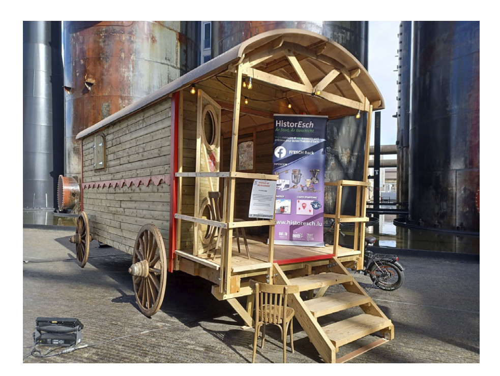
Figure 4. Wood wagon used to collect objects all over the town.

In order to develop participatory public history, the initiators of Histor Esch decided to not work with objects, archives, documents, and testimonies already present in official cultural institutions such as museums, archives, and libraries. We instead developed participatory collecting for three main types of sources: physical objects, photographs, and oral testimonies. We had public collecting events all around towns, either through community events or with our wood wagon (Figure 4). For the exhibition, we asked members of the public to look for family objects that they believe tell personal stories that reflect the history of the town. We also created a website where users could download pictures and descriptions of their object. We also use digital tools to gather private photographs of the town. In 2021 we launched a Facebook group about the history of Esch-sur-Alzette, which we called FL'ESCH Back — a play on the words "Esch" and "flashback." By 2022, it had accumulated 1400 members and served as a forum to share documents and stories and to discuss specific aspects of the town's history. Offering different channels of participation — on-site, online — allowed us to adapt to the variety of participants' profiles and availability.