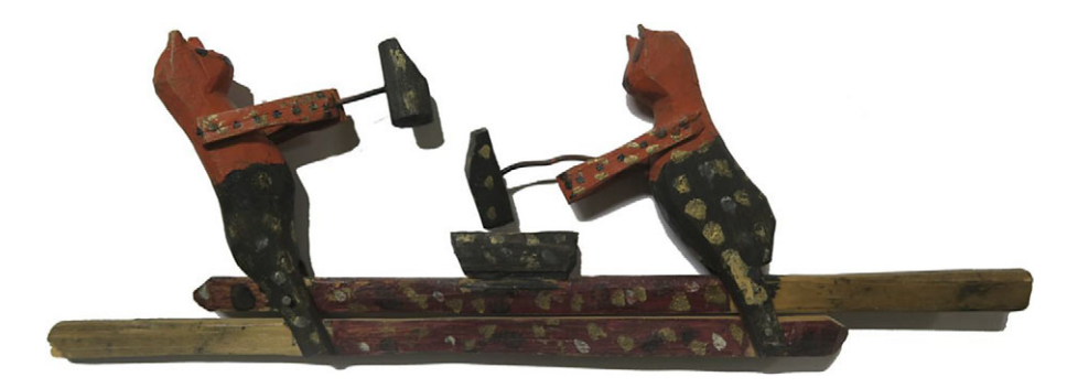
Figure 6. Wooden toy designed by an Ostarbeiter during the Second World War. Collected during one of the workshops.

for the opening of the exhibition to show how their objects – a bike, a teddy bear, a cooking tool – and their memories and stories were now part of a public history of the town. Participants appropriating the history of the town contributed to not only disseminating historical research but also empowering members of the public.