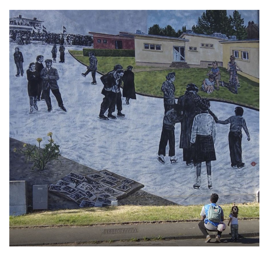
Figure 3. HistorEsch wall painting.

collaborate with archivists (roots), designers (branches), or historical witnesses (both roots and leaves). Working with media and communication specialists, computer scientists, and artists can for instance help to develop accessibility and therefore make history more public.