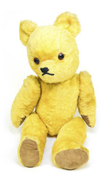
Figure 5. Teddy bear submitted online by Anna-Maria.

production.<sup>21</sup> We used oral history to counter-balance the relative absence of sources about certain groups in municipal and national archives. Besides the preliminary oral history of the residents in the mural's neighborhood, we identified groups and communities with whom we had little contact. For instance, while representing 15 percent of the whole population in the country, and close to one-third of the population in the Esch-sur-Alzette region, members of the Portuguese-speaking communities were relatively absent from the Histor Esch participants. Our next project Lovò is therefore based on a co-produced history of the town through the oral history of Portuguese-speaking grand-mothers.<sup>22</sup>