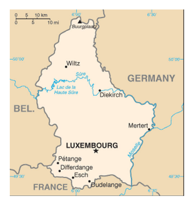
Figure I. Map of Luxembourg.

Luxembourg took this opportunity to propose, develop, and evaluate public history projects that connect researchers, cultural institutions, associations, and local residents.