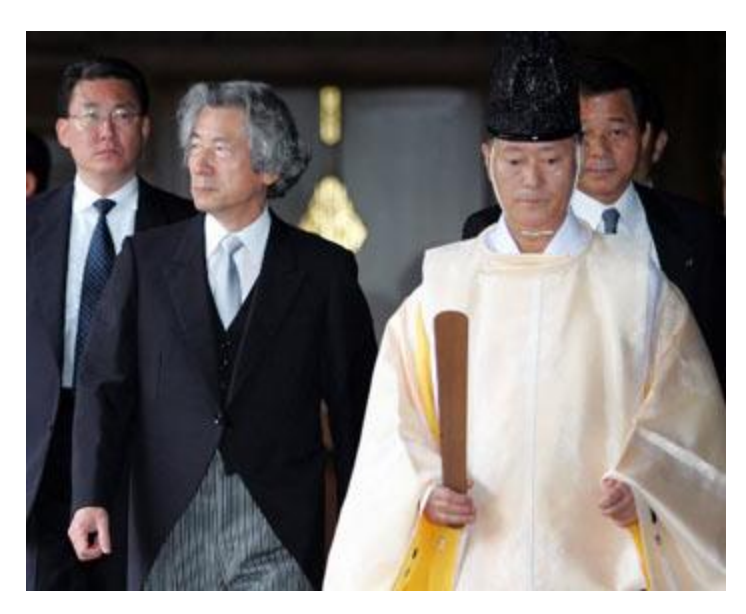
Prime Minister Koizumi at Yasukuni Shrine, August 15, 2006