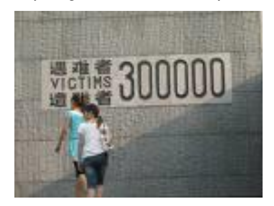
Nanjing Memorial: the iconic 300,000 figure

We apologize deeply to the people of China. We say again, 13,000, and even our minimum figure of 3,000, is an astonishingly huge number. We began our work of checking the military history, knowing that we were not completely clean. But with this huge number, we simply have no words. Whatever the severity of war or specificity of war psychology, we just lose words faced with this mass illegal killing. As those associated with the prewar military, we apologize deeply to the people of China. It was truly a regrettable act of barbarity.