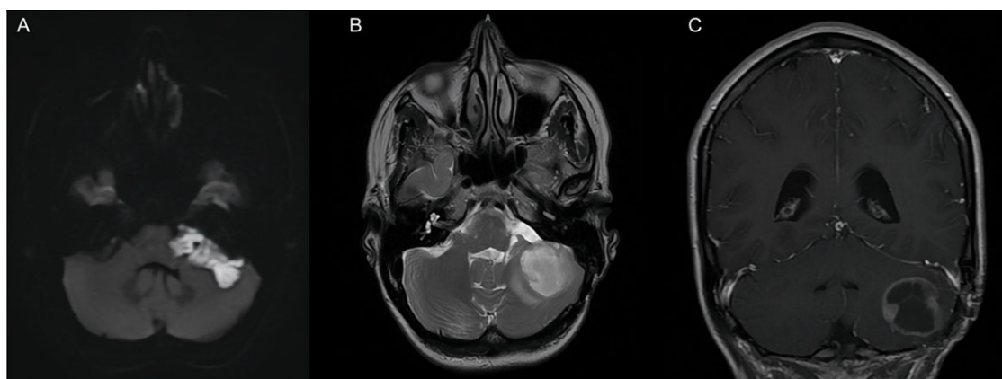
Figure 1. (A) Axial diffusion-weighted imaging (DWI) MRI of the benign-appearing left cerebellopontine angle tumour (43 × 17 mm) with diffusion restriction 11 months prior to index resection. (B) Axial T2 Fluid-attenuated inversion recovery (FLAIR) and (C) coronal T1 contrast-enhanced MRI demonstrating recurrent left cerebellopontine angle tumour (32 × 26 mm) 14 months post-index resection.