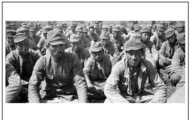
Japanese POWs in Siberia

The creation of the transwar regime was important, though, not only because of its domestic consequences, but also because of the ways in which it linked Japan into a web of cross-border activities that also affected the Cold War history of the region more widely. One crucial factor that made Japan a node in international intelligence gathering was the mass repatriation of Japanese soldiers and civilians from the lost empire and from prison camps in the Soviet Union and China.