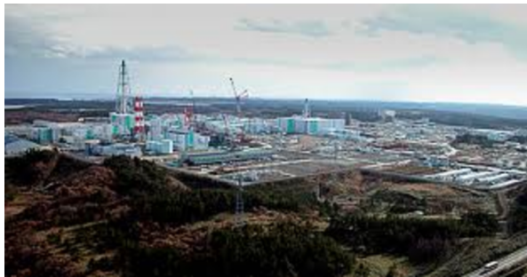
Rokkasho nuclear reprocessing plant

After the war, following the Comprehensive Land Development Law of 1950 and the Electric Power Development and Promotion Law of 1952, the electric power companies with regional monopoly cooperated with national policies to promote development of giant regional electric power sources. When selection of locations for nuclear power complexes began in the 1960s, places chosen from Tōhoku were Fukushima prefecture's coastal zone, which was poor enough to be called "Fukushima's Tibet," and Aomori prefecture's Rokkasho, which was a postwar settlement for repatriates from Manchuria. They had migrated to Manchuria in the period of economic crises in the 1930's under government policies which promoted the transfer of Japanese farmers to colonies and occupied areas.