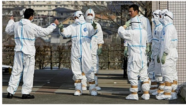
Workers at Fukushima Daiichi

The National Land Formation Plan, ratified by the cabinet in 2008, says: “Large cities and rural areas are mutually dependent in that the former lead the latter as headquarters providing urban functions, economic activities, and international exchanges, while the latter supply the former with personnel, food, water, energy, and so forth.” The position given to an area like Tōhoku is that of a supplier of food, work force, and electricity. Or, like Okinawa, it can host U.S. air bases. Such a structure can be said to have emerged out of the domestic division of labor in an era marked by total war and high-speed economic growth from the 1930s to the early 70s.