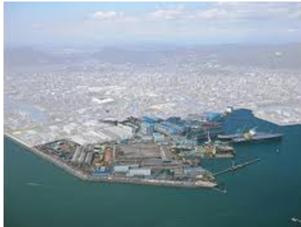
Mitsubishi Heavy Industries at Kōbe Harbor

The industrial structure of Kōbe around 1995, centering on ship building, steel manufacturing, and harbor business was the product of twentieth century Japan's industrial mapping, as was Tōhoku's rice production, parts manufacturing, and Kamaishi's steel manufacturing. When an area that has been hollowing out amid changes in industrial structure and international competition receives a blow from an earthquake, the slump of existing industries already underway is suddenly accelerated. The Kōbe economic slump was a result of this phenomenon.