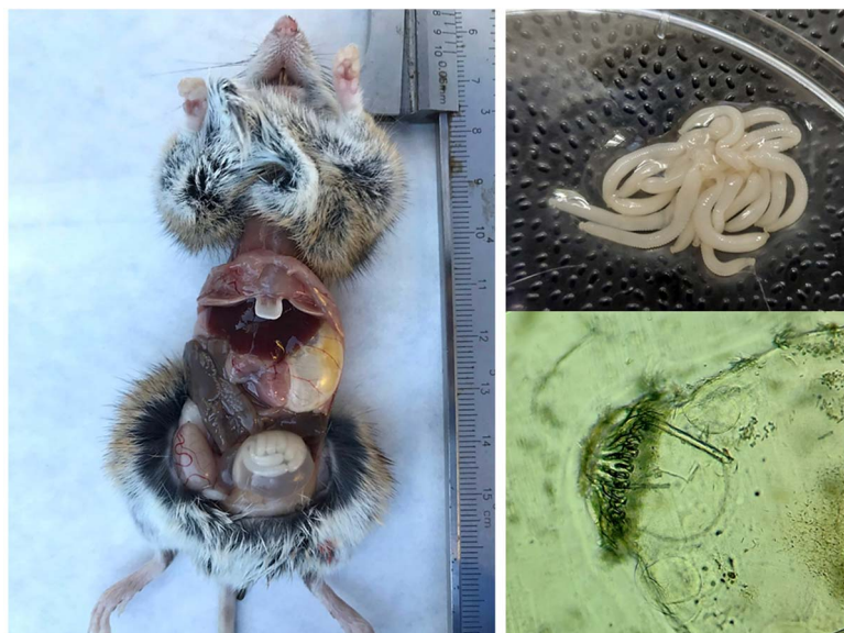
Figure 1. A wood mouse with an abdominal cyst (left); larvae extracted from the cyst (top right); a microscope image of the rostellum (bottom right).

neutrality indices (Fu's F_s and Tajima's D ) (Rozas et al., 2017). PopART 1.7 was used to create a median join network containing 25 cox1 nucleotide sequences from our study and 7 sequences from the GenBank® database (Bandelt et al., 1999). Pairwise nucleotide sequence divergences were calculated using the Kimura 2 parameter (K2P) (Kimura, 1980) model with a gamma value of 0.5 in MEGA (v.11) software.