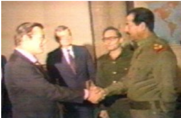
Saddam Hussain and Donald Rumsfeld in 1983

This confession was reported to the prosecutor and to the judges and it influenced their minds: it helped to convince Cooke, for instance, that "the King must die and monarchy with him." Charles Stuart had no remorse, so he deserved to die. This was Cromwell's fatal mistake: the King's execution made him a martyr, and paved the way in public sentiment for the restoration of the monarchy eleven years later. (It is a mistake about to be repeated: the execution of Saddam Hussein will most likely tip Iraq into full-blooded civil war.)