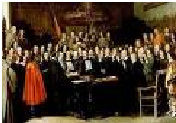
Signing of the Treaty of Westphalia

immunity to every prince, however Machiavellian. The best thing about the Treaty of Westphalia, however, was that England was not a party to it. On January 6th, 1649, the purged House of Commons passed an “Act” to establish a High Court of Justice, “to the end that no chief officer or magistrate may hereafter presume traitorously or maliciously to imagine or continue the enslaving or destroying of the English nation, and expect impunity for so doing...”