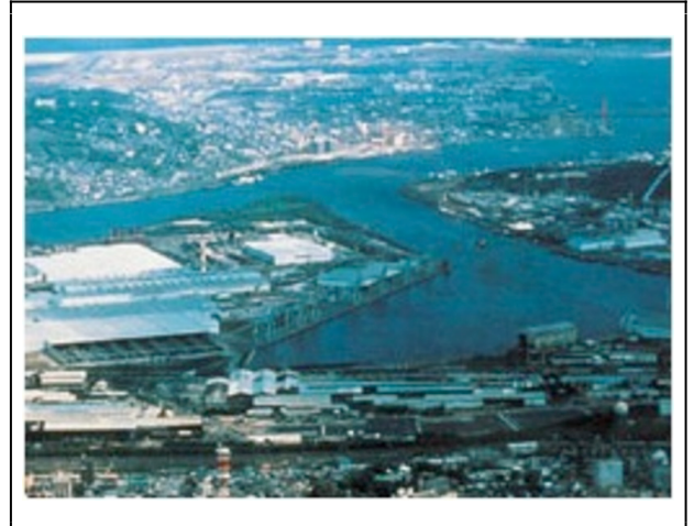
Kitakyushu's Dokai Bay (today)

The tax breaks in the international strategy zone are focused on lowering the corporate tax in order to foster competitiveness in international markets, while those in the regional revitalization zones centre on deductions for individual investment in enterprises that are part of the strategy.