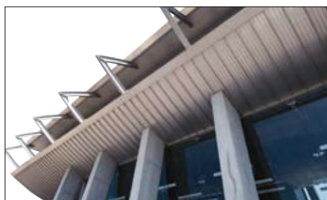
11% of the Australian commercial offices in central business districts are Green Star certified.

Climate Action recognises that a steel producer has fulfilled its commitment to take part in the worldsteel CO2 data collection programme.