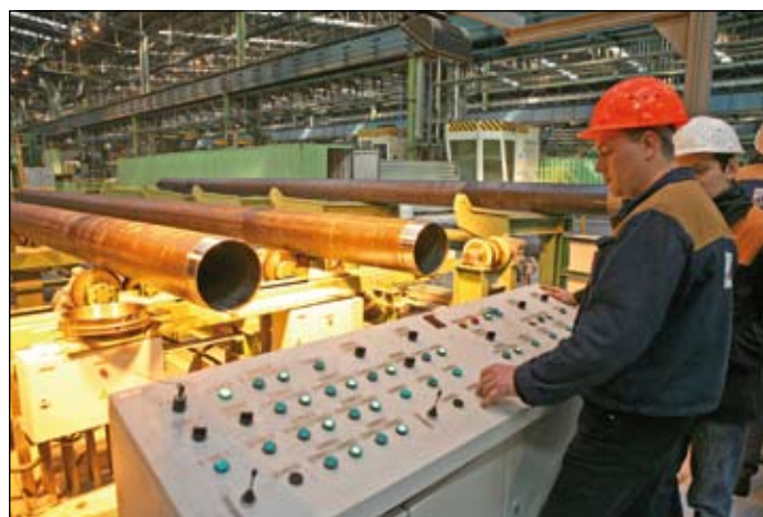
Shipments for ESPO-2 project will be complete in October.

TMK was also awarded contracts with Transneft, for the construction of the second phase of the Baltic Pipeline System (BTS-2), and for the Eastern Siberia Pacific Ocean phase-2 (ESPO-2) oil pipeline.