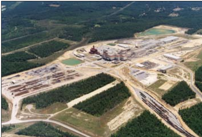
New quenching line in Mobile will allow capacity for QT plate to increase by approximately 200,000 metric tonnes.

In Borlänge, Sweden, work is continuing to establish a quenching line for quenched strip steel.