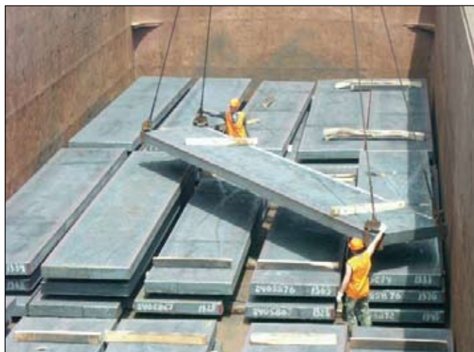
Azovstal exports its products to the Western Europe, Northern and Latin America, South-East Asia and Middle East.

Metinvest sales network in Russia covers the regions that are located close to the border with Ukraine (Rostov-on-Don, Belgorod, Krasnodar, Novorossiysk, Sochi, Adler, the Bryansk Region), as well as the major cities of Russia (Moscow, Saint Petersburg). Opening of new warehouses must enable to cover three federal districts and increase the number of regional service metal centers to fifteen.