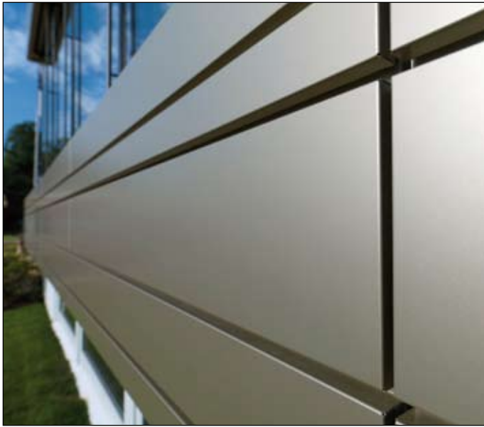
Zinc-magnesium coating and four paint coats ensure long-lasting quality.

of 130 grams per square meter, related to both sides, but with the same corrosion performance and reduced use of zinc. Organic coated flat products with a ZM EcoProtect coating have received German building code approval from Deutsche Institut für Bautechnik.