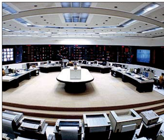
Posco's production control center in Pohang.