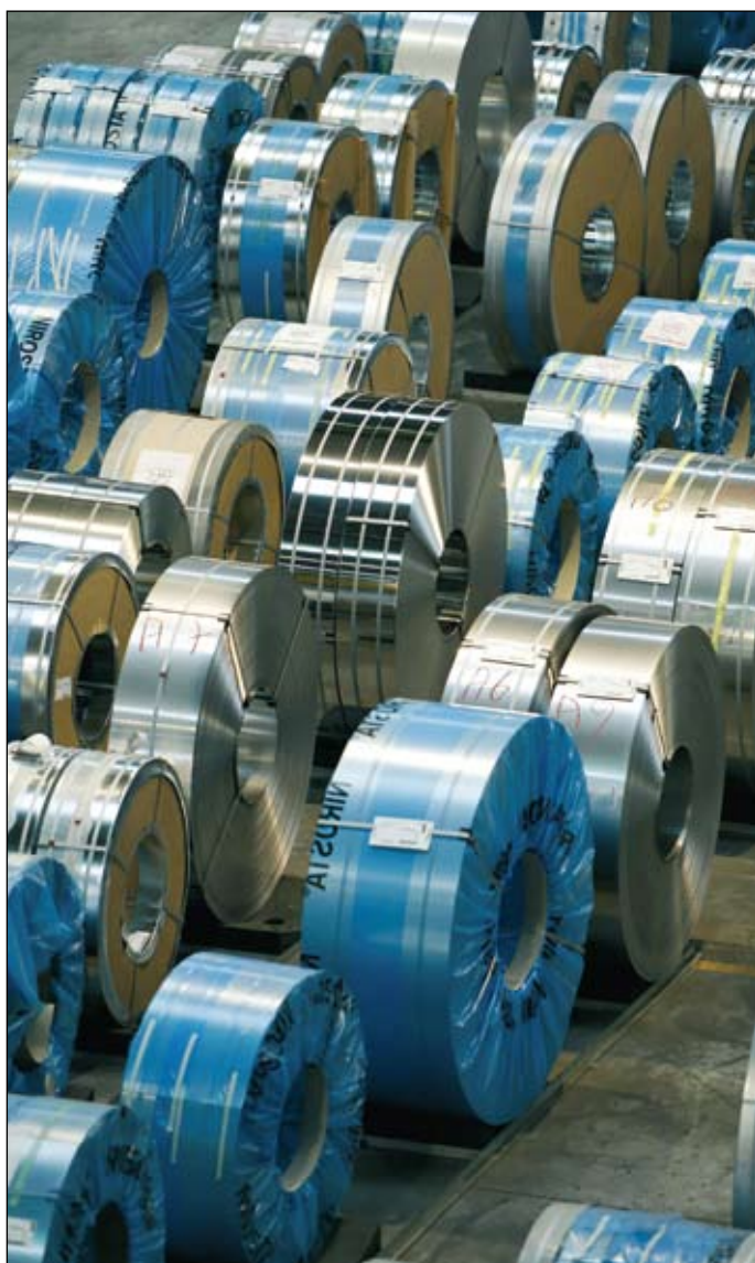
In the warehouse of ThyssenKrupp Nirosta, ready-to-be-shipped stainless steel is stored.