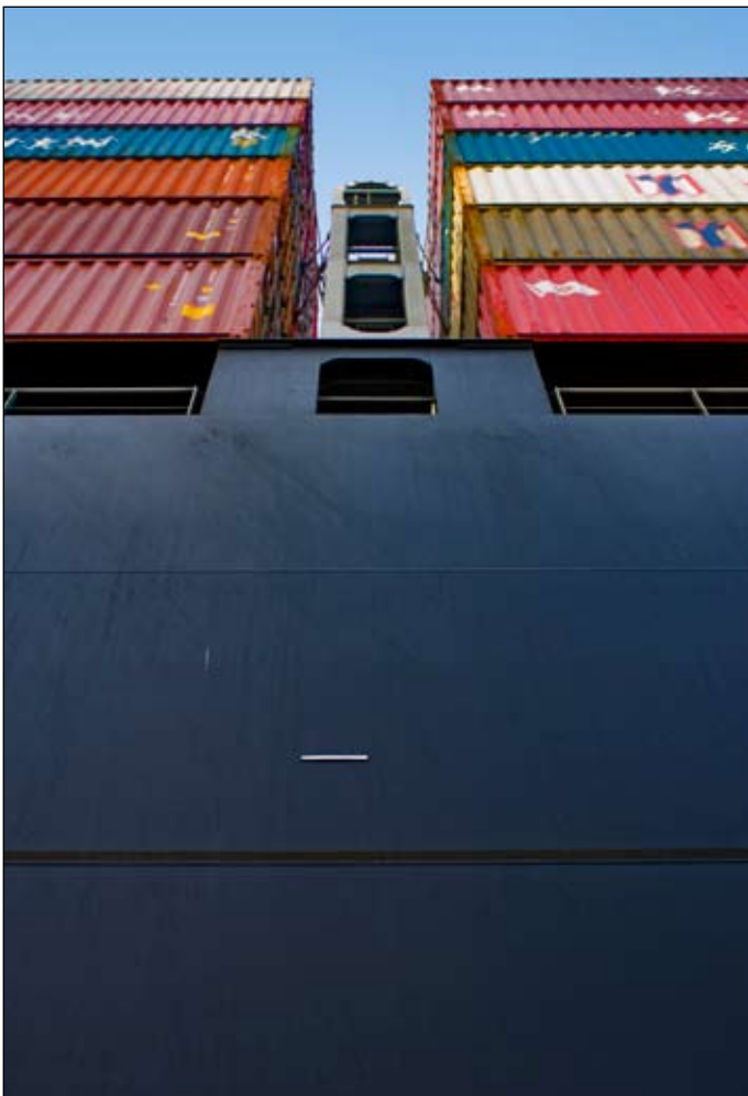
24 new freighters with a 1,600-tons capacity. Source: World Steel Association

Over the years ahead NRTC will be tripling its current fleet of 31 vessels to 92. These new container-compatible ships will then each have a capacity of 1,600 tons. The shipbuilders and hence direct recipients of the shipments are Alexandria Shipyards and Arab Contractors Shipyards in Helwan. ThyssenKrupp Mannex package covers alongside the actual steel, also consultancy and logistics services.