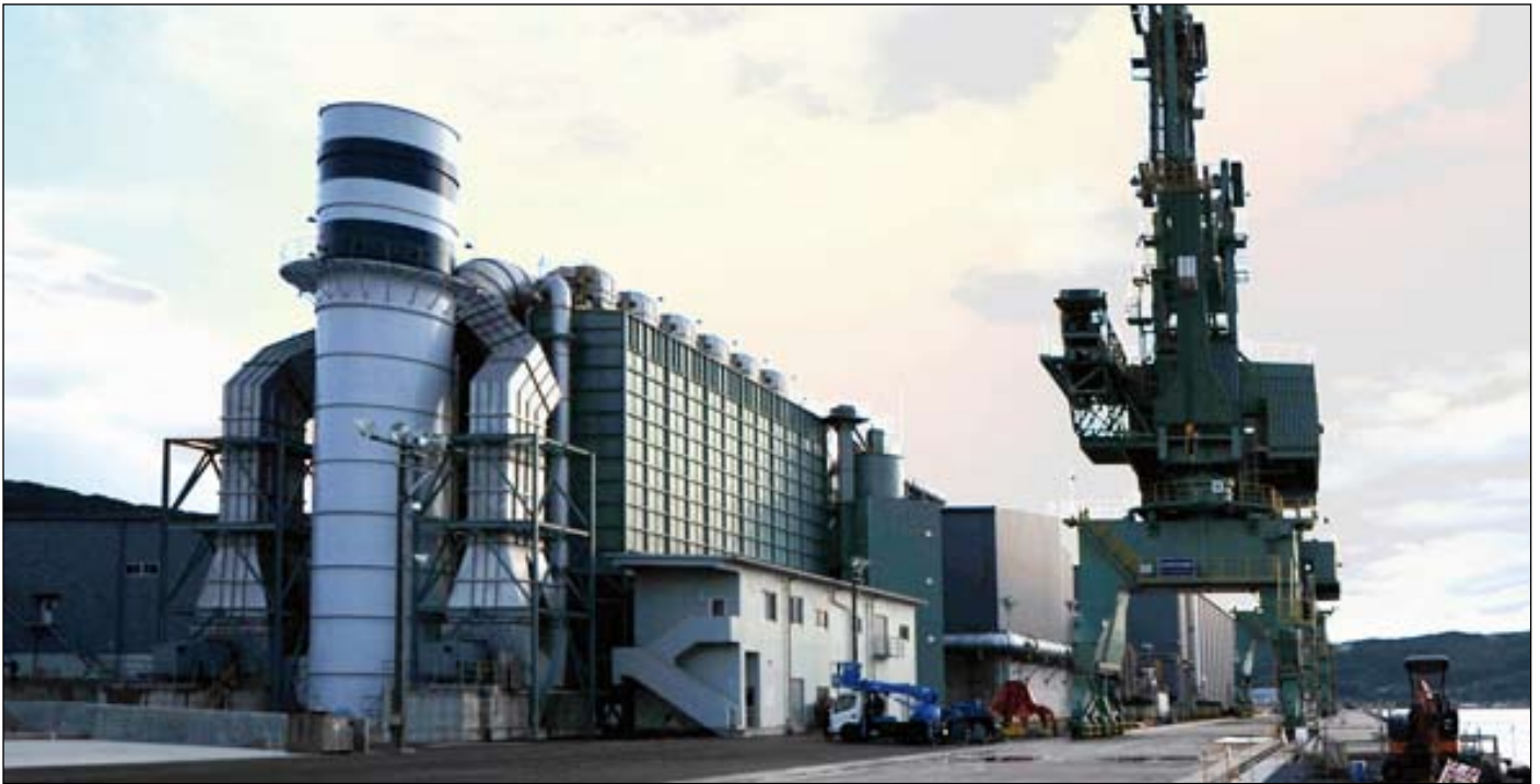
The Asia Special Steel Plant.

a new 2,020t blast furnace (Iran yearly steel production: ca. 10 million tons). POSCO E&C is also currently building coal fired power plants in Ventanas, Angamos and Campiche of Chile.