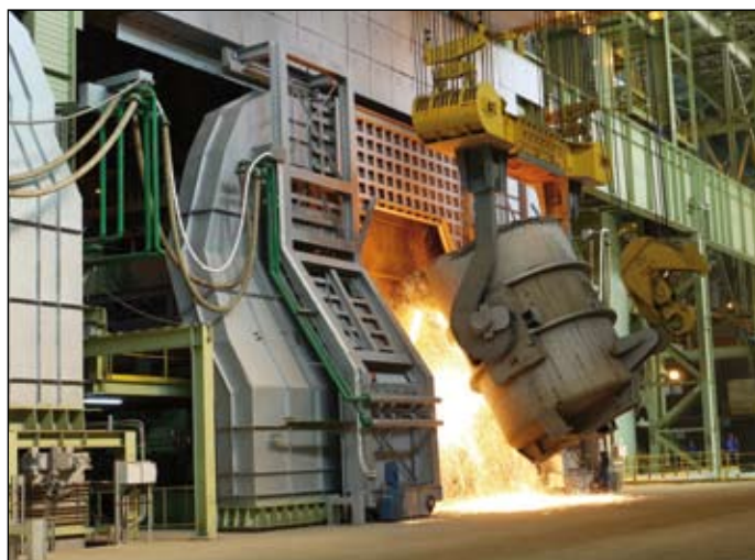
Dragon Steel annual production reaches 2.2 million tons.

In January 2010, SMS Siemag, Germany, successfully commissioned the first of two new carbon-steel converters at the Taichung works of