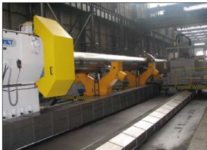
Lamination capacity at the Polish factory will double after 2012.

CELSEA Group concluded a 250-million euro investment in Poland to duplicate rolling capacity at its plant in Ostrowiec, a city the southeast of the country, where it operates through the "Celsa Huta Ostrowiec" subsidiary. Celsa Group set up in Poland in 2003 through the purchase of shares in the Huta Ostrowiec iron and steel works. The Po-