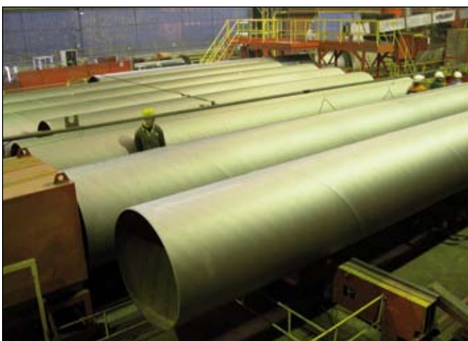
40,000 tonnes of spiral welded pipe were shipped for the Gazprom Pochinki-Gryazovets pipeline.

Besides, TMK is supplying Gazprom with Volzhsky longitudinal pipe for the construction of the Sakhalin-Khabarovsk-Vladivostok pipeline. For this project alone, a total of more than 70,000 tonnes were shipped by end 2009.