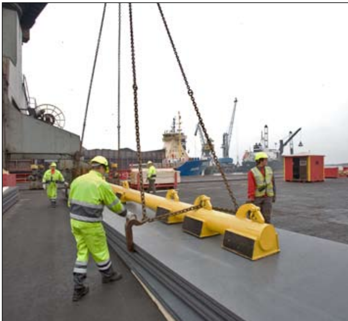
Polar conditions impose specific requirements on the steel material.