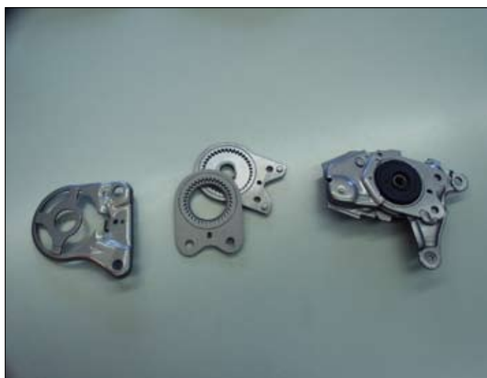
Seat back adjusting parts, capable of withstanding 2,000 Newton meters torsion forces.

Hoesch's range of micro-alloyed fine-grained structural steels has four new members. They are HSM 550 HD, HSM 600 HD, HSM 650 HD and HSM 700 HD. HSM stands for Hoesch Special structural steels Micro-alloyed and HD is the abbreviation for high-ductility, which means they have very good cold-forming properties. The numbers indi-