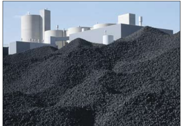
70,000 metric tons of foundry coke will be delivered to Duisburg each year.

ThyssenKrupp MinEnergy GmbH has signed a 10-year agreement with Poland's biggest foundry coke producer in Waldenburg, Lower Silesia, under which 70,000 tons of foundry coke will be delivered to Duisburg each year. Stacked one meter high, that's enough coke to cover an area of around 30 soccer pitches. The coke will be transported from the Polish coke plant to Germany by rail in special containers known as black boxes, each with the payload of a road truck (27 tons). The journey from Waldenburg to Duisburg takes around 36 hours.