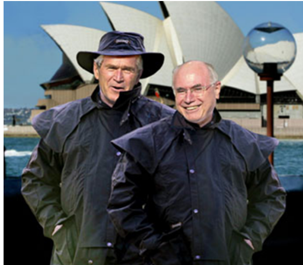
Australian Prime Minister John Howard with President George W. Bush.

Along with other US “client states,” Australia bears a responsibility, rarely acknowledged, for the often devastating consequences of diplomatic choices adopted out of the belief that, at all costs, the interests of their super-power ally had to be given priority.