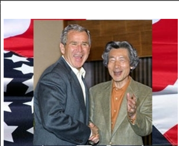
President George W. Bush and Prime Minister Koizumi Junichiro, July 2006

the kernel of the relationship. Not until the rise of the Democratic Party 40 years later did that change, when the “ zokkoku question” merged with the “Okinawa question” (on which below).