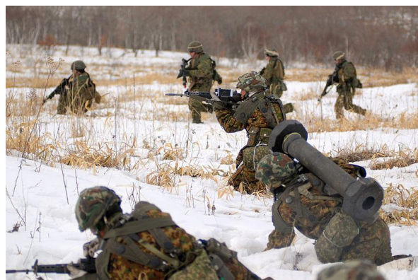
Joint US-SDF military training conducted in Hokkaido (Yausubetsu, 2008)

The prosecutors responded by presenting the Nozaki brothers’ act of cutting telephone cables as illegal and irrational. In their view, the Nozaki family had been benefiting from the SDF on a daily basis. The SDF allowed the family to use a reservoir inside the maneuver field to generate electricity and for drinking water. The SDF also provided the family with land, rent-free, to build a pipe connecting the water reservoir to their house. When the pipe was clogged with mud in September 1962, the Northern Eniwa Unit unclogged it at no charge at the family’s request. The prosecutors also downplayed the noise problem. Responding to protests by the family, an officer from the Northern Army visited the family in 1962 to check the noise levels for himself. On that day, according to the prosecutors, the SDF was conducting firing drills with tanks, but the noise was so minimal that Nozaki Takeyoshi grumbled the officer had deliberately chosen a quiet day. The prosecutors used this one-off incident to argue that the Nozaki brothers were exaggerating their suffering. 20 For them, the Nozaki brothers were simply insolent residents who did not sufficiently appreciate the benefits they were receiving from the SDF. The prosecutors strongly argued that the SDF was working for the improvement of people’s lives. They chose to ignore the argument that what they identified as “defense capability” could actually destroy individual lives in the name of the defense of the nation-state.