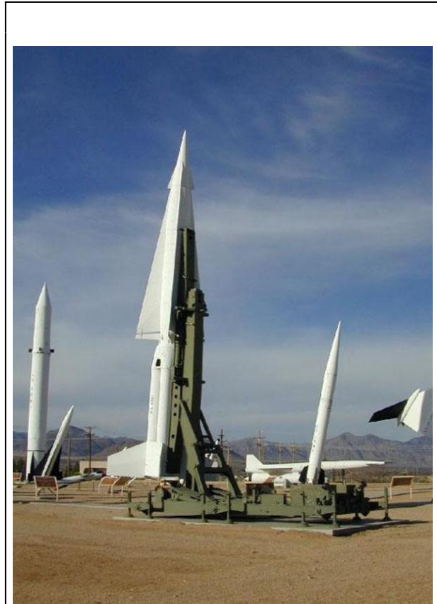
Nike Hercules

the Japanese government launched the Third Defense Buildup Plan, which included strengthening of air defense through domestically manufactured Nike missiles as a primary goal. 35