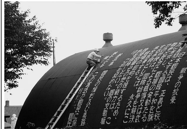
Kawase Hanji's protest against the SDF on the roof of one of his buildings in the middle of the Yausubetsu Firing Range (Kawase passed away in 2009).

In 1961, the Ground SDF's four divisions in Hokkaido consisted of 32,000 service members, about one third of all Ground SDF service members deployed in Japan. 5 On the one hand, this nurtured close economic relations between the SDF and those communities hosting SDF bases, such as Asahikawa and Chitose. The SDF engaged in disaster relief and civil engineering, and these activities were crucial in fostering local public support for the SDF. 6 However, the concentration of SDF personnel and facilities also generated tensions with civilians. Frequent loud noise caused by firing during military maneuvers disturbed civilians' everyday lives and jeopardized their health. During the Cold War, Hokkaido, together with Okinawa, became a focus for anti-base activism, and as Philip Seaton, Kageyama Asako, and Tanaka Nobumasa have noted in this journal, local struggles with the SDF and the US forces continue to this day in Yausubetsu in Eastern Hokkaido. 7