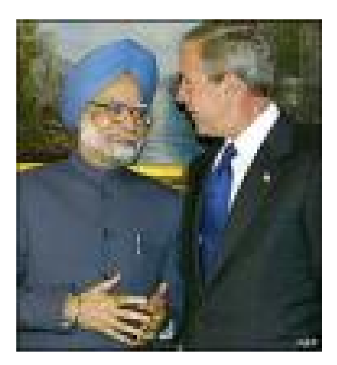
George Bush with Manmohan Singh

An even bigger prize, in Washington's view, would be the integration of India into this emerging alliance system, a possibility first suggested in Rice's Foreign Affairs article. Such a move was long frustrated by congressional objections to India's nuclear weapons program and its refusal to sign on to the Nuclear Non-Proliferation Treaty (NPT). Under U.S. law, nations like India that refuse to cooperate in non-proliferation measures can be excluded from various forms of aid and cooperation. To overcome this problem, President Bush met with Indian officials in New Delhi in March and negotiated a nuclear accord that will open India's civilian reactors to International Atomic Energy Agency inspection, thus providing a thin gloss of non-proliferation cooperation to India's robust nuclear weapons program. If Congress approves Bush's plan, the United States will be free to provide nuclear assistance to India and, in the process, significantly expand already growing militaryto-military ties.