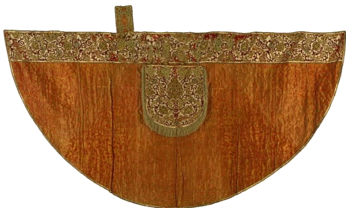
Figure 1. Liturgical cope belonging to D. Teotónio of Braganza.

[1] Espanca, T., “Nova miscelânea: D. Teotónio de Bragança – um prelado eborense do tempo de Camões (1530-1602)”, in A cidade de Évora . Évora: V.40-41, n.67-68, p.137-147, 1984/85.