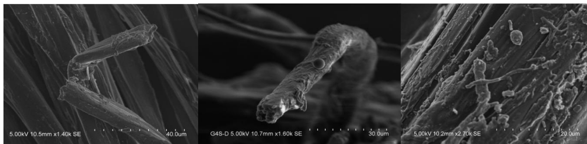
Figure 3. SEM micrographs of the historical fibres exhibiting fracture, roughened surface and biological colonization.