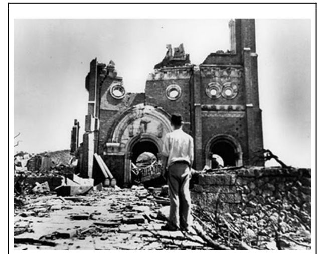
The ruins of Urakami Cathedral in 1945

It was the providence of God that carried the bomb to its destination. ... Nagasaki, the only holy place in all Japan – was it not chosen as a victim, a pure lamb, to be slaughtered and burned on the altar of sacrifice to expiate the sins committed by humanity in the Second World War?<sup>11</sup>