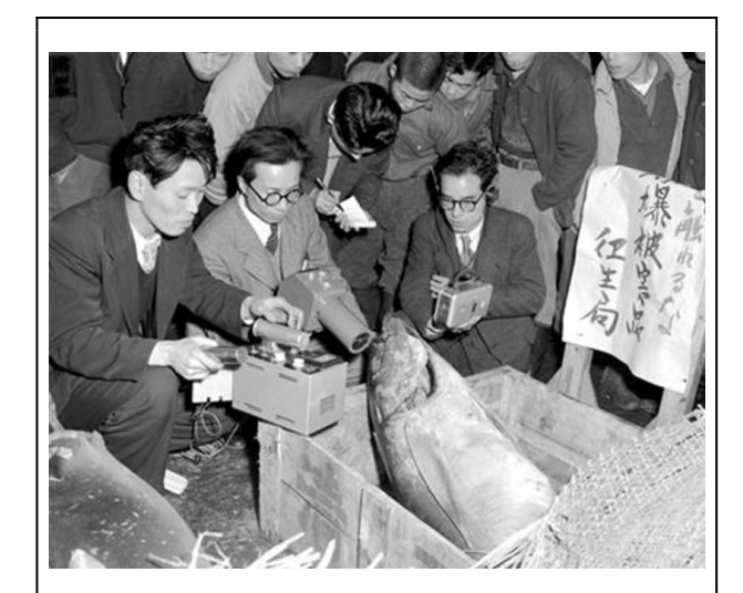
Testing tuna for radioactive contamination following the Lucky Dragon No. 5 incident

Still, it is apparent that a widespread national consensus on Hiroshima and Nagasaki as the foci of Japanese suffering as victims of atomic bombs did not emerge till after 1954. In that year, a fishing boat ironically named the Lucky Dragon #5 became the accidental victim of a U.S. hydrogen bomb test, sparking a national anti-nuclear movement and interpretations of Japan having suffered a "third bombing."<sup>8</sup>