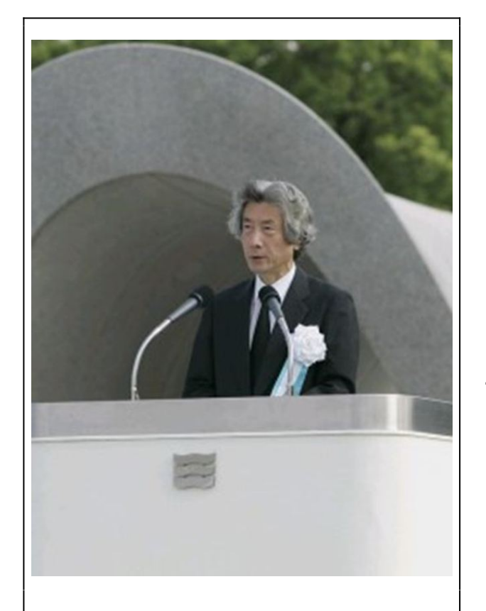
Koizumi speaking at Hiroshima in 2005

What alternative understandings does this official reading elide? In the immediate postwar period, "Hiroshima and Nagasaki" in Japan were not instantly held up as national symbols of "peace," and even less so as signifiers of "culture" - two deeply ambiguous terms assumed to be phenomena with homogenous, universal meanings and values. In fact, for the first decade after the end of Japan's war in Asia, the two A-bombed cities remained firmly in the shadow of other major events: the Allied Occupation of Japan, the start of the Cold War and the crackdown on Communism, and the Korean War. It hardly helped that the hibakusha (victims; literally, "explosionaffected people") of both cities were often feared and socially marginalized. Many of them had faces and bodies grotesquely damaged by heat and radiation from the explosions; many of them were considered tainted with the contagious poison of the atomic bombs.<sup>2</sup>