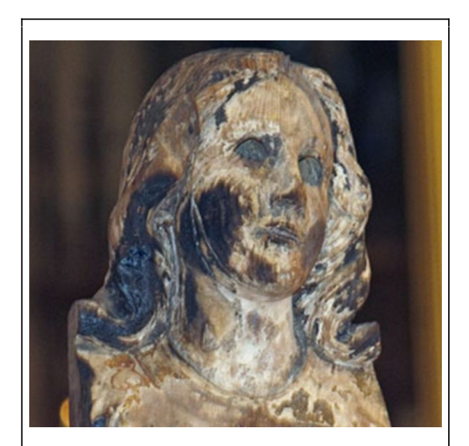
A Madonna scarred by the bombing serves as a powerful symbol in Nagasaki

But what is it based on? Nagasaki is often treated as the "passive" city in opposition to "active" Hiroshima, despite there being little political or economic basis for this distinction. Beginning in the mid-1950s, for instance, activists and officials in both cities scrambled to install new bomb-related organizations and monuments - hibakusha support groups, atomic bomb hospitals, and peace museums.<sup>22</sup> If Nagasaki appears to lag behind Hiroshima in comparisons of the quantity and timing of the two cities' officially sponsored activities (e.g. city councils established to serve hibakusha needs), the difference in each city's size and revenues must be taken into account: Nagasaki has a population under half of Hiroshima's, which puts it at a financial disadvantage relative to Hiroshima.<sup>23</sup> Without concrete reasons to distinguish between Hiroshima and Nagasaki as "active" and "passive" cities, ikari and inori are best seen as a phenomenon whose root influences are social and cultural in nature. This simplistic binary overlooks the fact that anger and prayers have always simultaneously existed among the people of both Nagasaki and Hiroshima, and it glosses