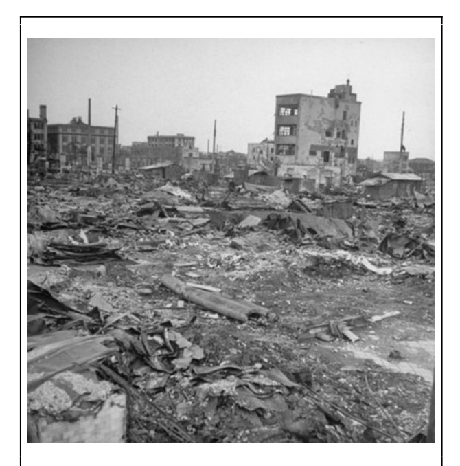
Tokyo in ruins after American firebombing in 1945

In fact, as earlier mentioned, Hiroshima and Nagasaki had not yet become the focal points of the narrative of Japanese national suffering in the Asia-Pacific war. By the time of Japan's surrender, 66 Japanese cities - including Hiroshima and Nagasaki - had been firebombed, leaving many of them in ruins not dissimilar to the destruction in the two atombombed ones. A good illustration of this comes from how some members of the Diet opposed a proposal to pass laws that would release extra public funds to the two atomic-bombed cities for reconstruction. Many other cities had been bombed and suffered high casualty tolls, they said; on what grounds should Hiroshima and Nagasaki be singled out for special treatment?<sup>6</sup>