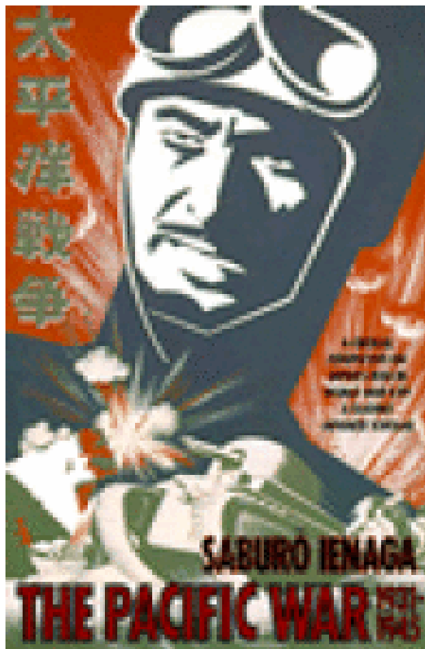
Ienaga Saburo's The pacific War.

A study of the postwar politics of revelation of Japanese wartime medical experiments does not engage the issues of the causes of those initiatives and cannot predict the degree to which we might see questionable medical practices surfacing again in Japan's future. But by shifting the focus from the purported "culture" to the politics of Japanese "forgetfulness" after 1945, it does suggest that an important indicator of future developments may be found less in certain Japanese cultural practices (as is often stressed in the literature on Japanese bioethics),[73] than in the political lay of the land. The politics of exposure of wartime Japanese BW experimentation remains as vital as ever and continues to enrich Japanese public consciousness regarding this dark chapter of national history. Likewise, critical issues of bioethics (brain death, stem