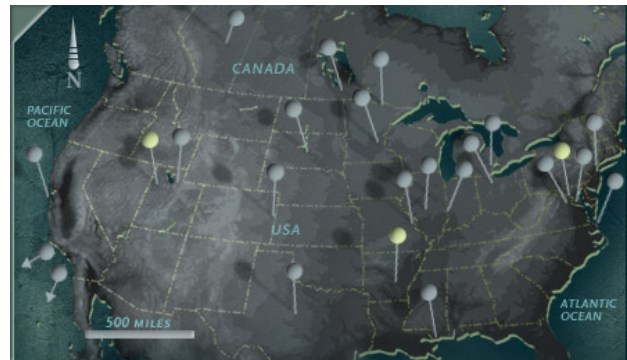
US bioweapons map, early 1950s.

recent years in the tale of possible American use of biological agents in the Korean War.[28] But the American appetite for such investigations is so low that the publishers of a celebrated British study of Unit 731 saw fit to excise the Korean War chapter highlighting U.S. collaboration with Japanese BW experts in Korea in the American edition of their work.[29]