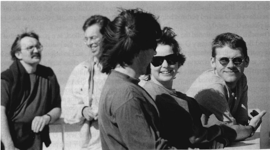
Pollock, St-Louis, Crowther

Willis: The atmosphere eclipse effect in \gamma Vel can be seen in the intercombination line CIII] 1909, despite its low f-value, because (i) the WC8 mass loss rate is high, leading to high CIII column-density, (ii) the high abundance of carbon in the WC8 wind. Modelling the eclipse effect observed in CIII] 1909 in \gamma Vel gives a WC8 mass loss rate of about 7 \times 10^{-5} M_{\odot} \text{y}^{-1} , consistent with M from the radio, and this confirms that eclipses in the intercombination line is observed, as first pointed out by Willis & Wilson (1976, A&A, 47, 429) who first identified this phenomenon of selective wind line eclipses in WR+O systems.