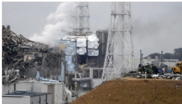
Damaged reactors at Fukushima Daiichi

Japan's searing summer of 2013 saw the lid slide further off Fukushima Daiichi and its Pandora's box of radioactive and political crises. The company in charge, Tokyo Electric Power Company (Tepco), already Japan's most distrusted firm, 2 was irredeemably exposed as dangerously incompetent. A slew of reports concerning leaks of high-level radiation led to increasingly concerned appeals, from within Japan and from overseas, for the Abe Shinzo government to take over at Fukushima Daiichi.