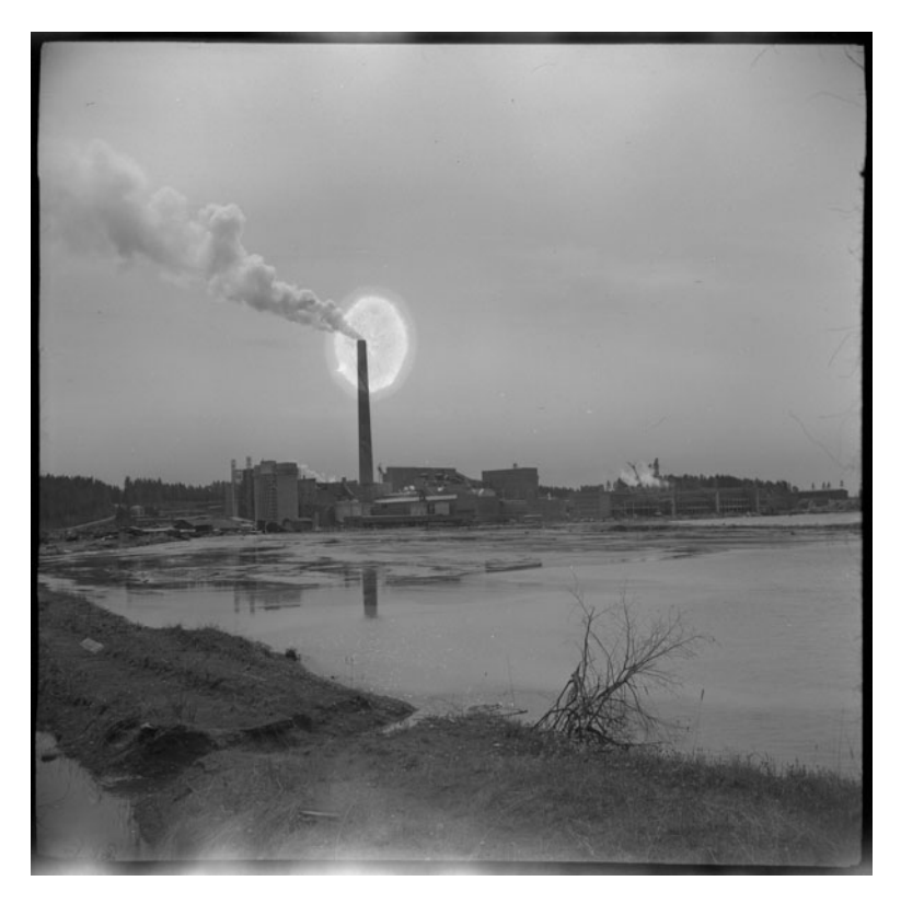
Figure 3. Kaukopää factory, 1955. The photograph depicts the timber floating area, through which logs would be floated into the plant for processing. This water was also pumped into the mill, but by the early 1970s it was fully contaminated with chemicals such as chlorine (used to bleach cellulose), leading Enso-Gutzeit to try to find a solution to pump clean river water into the plant and to send the dirty water downstream to the hydropower plant. See Erkki Vaalama, Enso-Gutzeit oy Kaukopään tehtaat, 1935–1985 (Imatra, 1985), p. 203. Photograph by Pentti Roiha. Source: Etelä-Karjalan museo, KUVKVV1499:13. Creative Commons (CC BY 4.0).

indicating that the city wanted to ensure quality of life for its citizens as much as possible without drawing the ire of local factories. Based on oral history evidence during the focus group discussion, this burst pipe was originally from the Kaukopää factory and leaked large quantities of black liquor into the Vuoksi river and onto its banks. Benjamin snidely chuckled, 'The employee representative ( pääluottamusmies ) of Kaukopää sat on the city council board at that time', and Daavid supplemented, '[The head of] Enso-Gutzeit also sat on the board. From that you can find your own potato field.'61 This