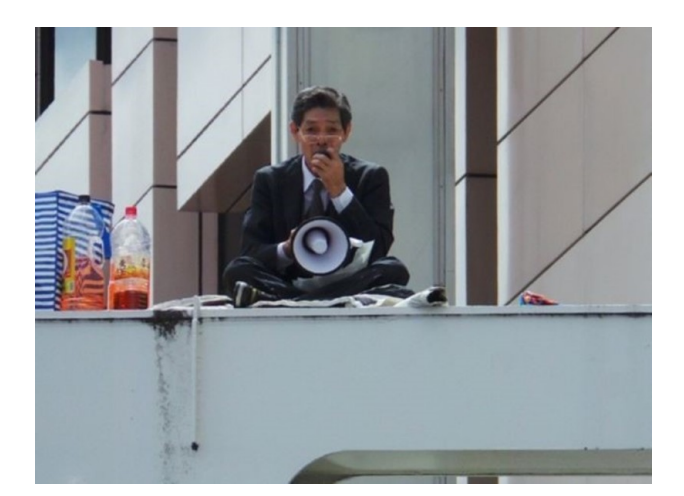
June 29, Shinjuku protest speech before a Saitama man set himself on fire

Just four and a half months earlier, in Shinjuku, a major Tokyo commercial and entertainment district, another man from Saitama, north of Tokyo set himself afire in the middle of a busy shopping street, barely escaping death. His name has not been reported but Asahi Shimbun's follow-up article two month later describes him as a previously homeless man in his sixties now living on welfare. This selfimmolation occurred on June 29, in the midst of a national debate over re-interpretation of Article 9 of the constitution that would allow Self Defense Forces to fight wars outside Japan in support of its allies, namely the United States. His act was witnessed by hundreds, many of whom photographed it and posted on social media sites.