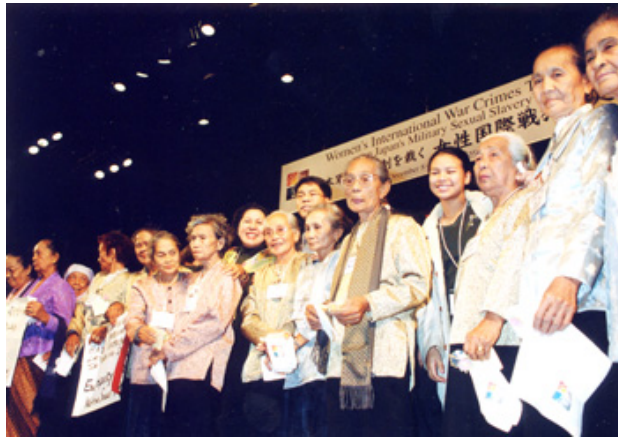
Former "comfort women" at the Tribunal

Held in public, the Tribunal attracted audiences of some 1000 people each day, and involved the participation of 62 survivors from eight countries and as well as two former Japanese soldiers. It was widely reported by such international media as the Washington Post , Wall Street Journal , Frankfurter Allgemeine Zeitung , Korea Times and the Australian Broadcasting Corporation. By contrast, only one Japanese national newspaper – the Asahi – covered the Tribunal in any detail, and Japan's television channels largely ignored the event.