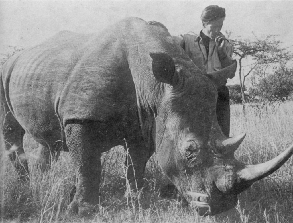
Plate 3: A bull rhinoceros waits patiently. In this state, a rhinoceros will readily enter a crate.