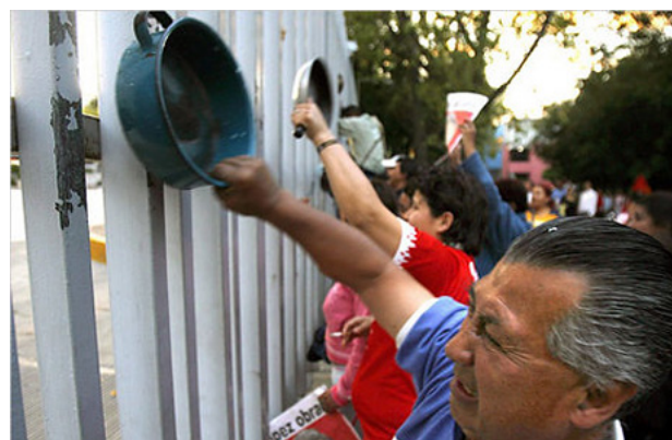
Mexican food protest

that in the years preceding the tortilla crisis, the homeland of corn had been converted to a corn-importing economy by "free market" policies promoted by the International Monetary Fund (IMF), the World Bank and Washington. The process began with the early 1980s debt crisis. One of the two largest developing-country debtors, Mexico was forced to beg for money from the Bank and IMF to service its debt to international commercial banks. The quid pro quo for a multibillion-dollar bailout was what a member of the World Bank executive board described as "unprecedented thoroughgoing interventionism" designed to eliminate high tariffs, state regulations and government support institutions, which neoliberal doctrine identified as barriers to economic efficiency.