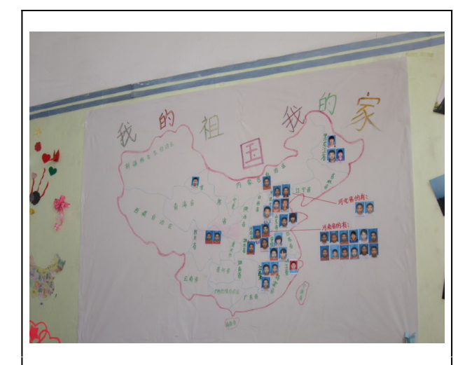
"My Motherland, My Home." A map in a migrant classroom shows how the students come from all across China.

expand access to urban schooling. The central government has repeatedly issued policy directives stating that the education of migrant children is the host cities' responsibility, but provinces and cities have adopted the policy at their own pace and using different measures, with varying success.