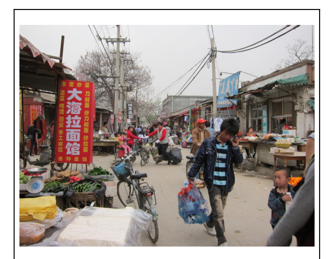
A bustling, self-sufficient migrant community.

in cities. Those who enroll in public schools tend to have spent a longer time in the city than their counterparts who enroll in migrant schools. The migration process of migrant families is often a serial or even cyclical one, with family members following each other between their hometowns and cities.