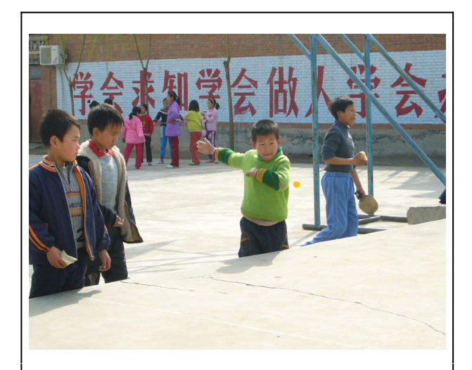
A migrant student plays table tennis without a bat at school.

schools according to their examination scores. However, only students with local hukou are assigned a public high school spot after participation in the examination; migrant students from licensed schools are allowed to participate, and receive an examination score, but they are not admitted to a public high school. In Shanghai, students with non-local hukou who are middle school graduates from both licensed and unlicensed schools are barred from taking the public middle school examination.