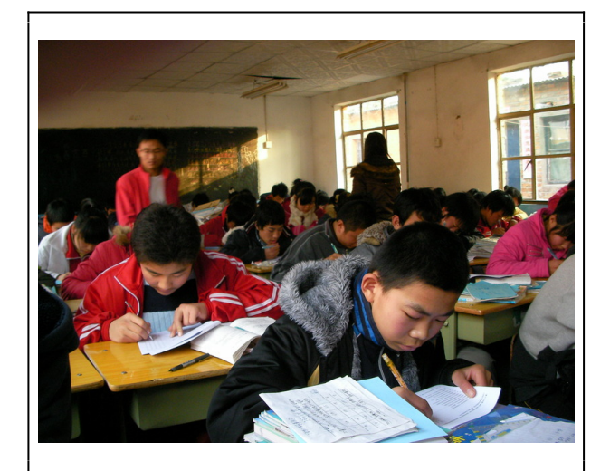
Ninth-grade migrant students participating in our survey.

In 2008, there were 405,000 migrant children in Beijing; there were 385,703 in Shanghai in 2006 (Cheng 2008; Tian and Wu 2009). These are the most recent official figures to have been made publicly available. However, conservative estimates put the current number of migrant children in Beijing and Shanghai at about 700,000 in each city. A survey in Beijing conducted in 2000 found that 72 per cent reported living with their spouses. In addition, over 36 per cent of those who lived with a spouse in Beijing had children studying locally (Chen & Liang 2007). An increasing proportion of migrant children were born in Beijing. Han (2007) found that the proportion more than tripled, from 5 per cent in 2000 to 16.2 per cent five years later.