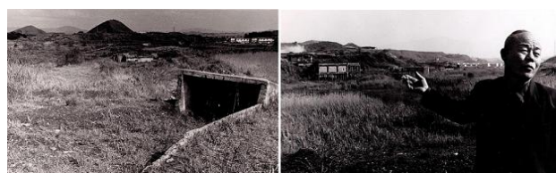
Aso Mining's former Akasaka mine in the late 1970s and a Korean forced to work there during World War II.

"The corporations' survey of remains has been insincere," the South Korean official said. "It is also strange that the family company of the foreign minister, who should be setting an example, has provided no information whatsoever." [2]