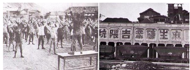
Left: Aso miners doing calisthenics during the war; right: ore cars at the Aso Yoshikuma mine.

"In response to the enemy's materiel offensive, we will fight by means of increased coal production," said Kishi Nobusuke, then Japan's minister of commerce and industry. "All miners must come together in spirit and the patriotic mining industry must dash forward."