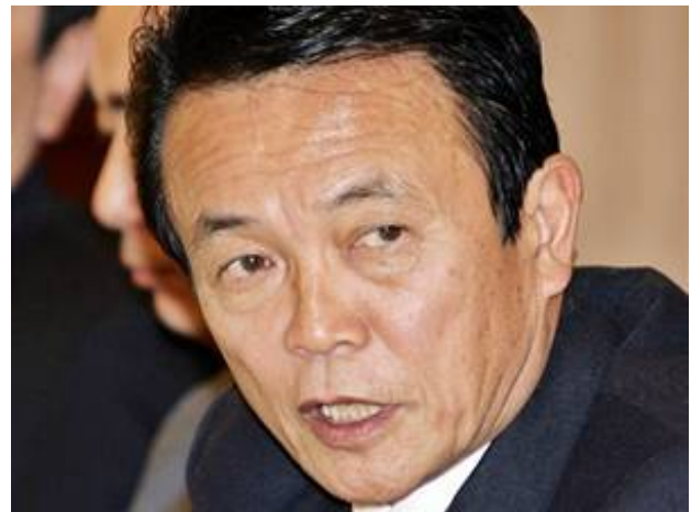
Aso Taro: Japan's future leader?

Japan the Tremendous , a bestseller written in a populist tone, highlights the peaceful nature of postwar Japan and calls the country a "fount of moral lessons" for Asia. Arc of Freedom and Prosperity: Japan's Expanding Diplomatic Horizons expatiates on Aso's tenure as foreign minister from October 2005 to August 2007.