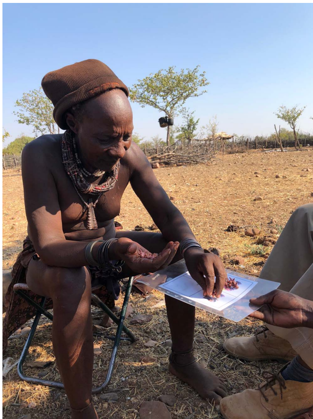
Figure 1. Himba man participating in task to assess community perceptions of the aggregate nonpaternity rate.

work we opted for nondisclosure. To address some of the limitations of nondisclosure, including creating a disparity between researcher and community knowledge and the possibility of researchers being pressured to disclose, we devised a double-blind procedure for testing and analysis. We first outline the steps of this procedure and then discuss the benefits and limitations of using a double-blind method.