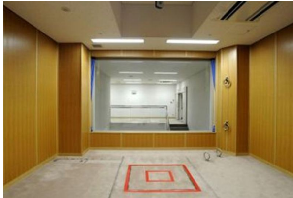
Illustration of Japanese execution room

In my view, the most striking thing about the media coverage of Kijima's trial is how much more of it there was than there was for another long capital trial that occurred a few months earlier. In the latter, Takami Sunao was convicted of killing 5 persons and injuring 10 by setting fire to a pachinko parlor in Osaka in July 2009. Takami was sentenced to death on October 31, 2011, but his trial was epoch-making in that his tribunal had to consider the claim that capital punishment is unconstitutionally cruel because hanging often results in either decapitation or the prolonged suffering of the condemned while he or she dangles at the end of a rope. This was the first time in more than 50 years that the constitutionality of capital punishment was seriously contested in a Japanese trial, and lead defense lawyer Goto Sadato even persuaded Chief Judge Wada Makoto to allow testimony from two expert witnesses: Walter Rabl, the president of the Austrian Society of Forensic Medicine, who told the court that, based on his own extensive studies, hangings are frequently botched; and Tsuchimoto Takeshi, a retired prosecutor who described what it was like to watch a hanging in the 1970s ("when looked at directly, the cruelty of hanging cannot be endured"). Goto also persuaded Judge Wada to ask the Ministry of Justice to disclose information about botched executions and the