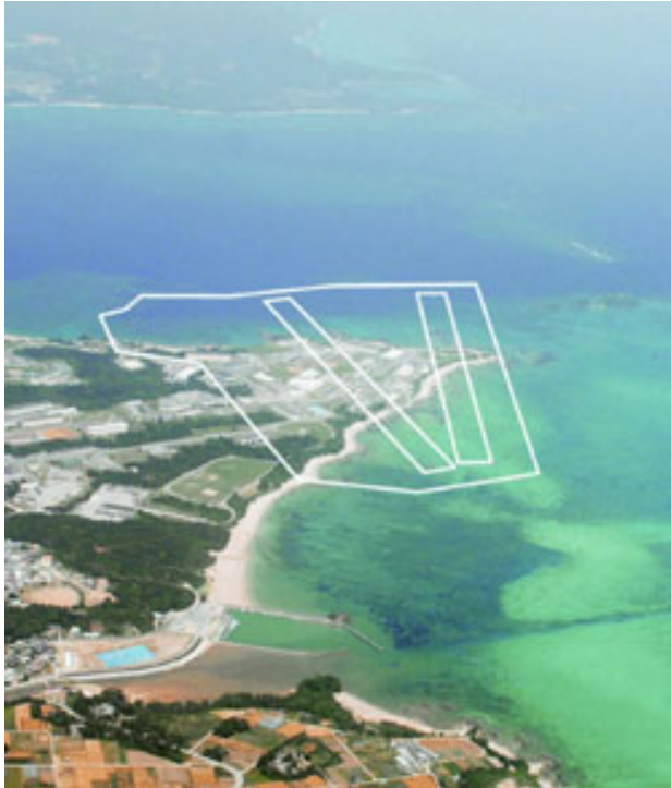
US plans for the Henoko Base runway