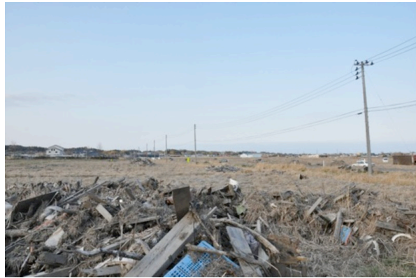
Odaka under mountains of debris one year after the earthquake

In many places, water is leaking as the tsunami and earthquake shifted the ground. Debris from the disaster is scattered everywhere, and houses, shrines and infrastructure are badly damaged. By contrast, the cherry trees were in full bloom as if nothing was wrong, regardless of the chaos caused by contamination and radiation.