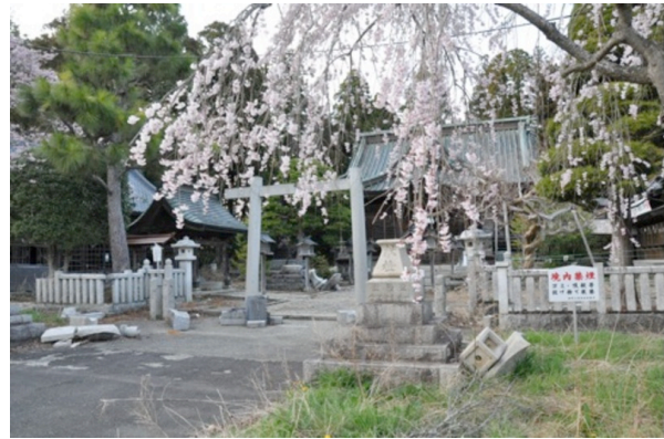
Odaka-Shrine--deformed by the earthquake

April is a symbolic month in Japan because thousands of students enter new schools. Some public schools in the city that were closed amidst fears of high radiation are now able to reopen, based on the results of the local governmental reports on decontamination.