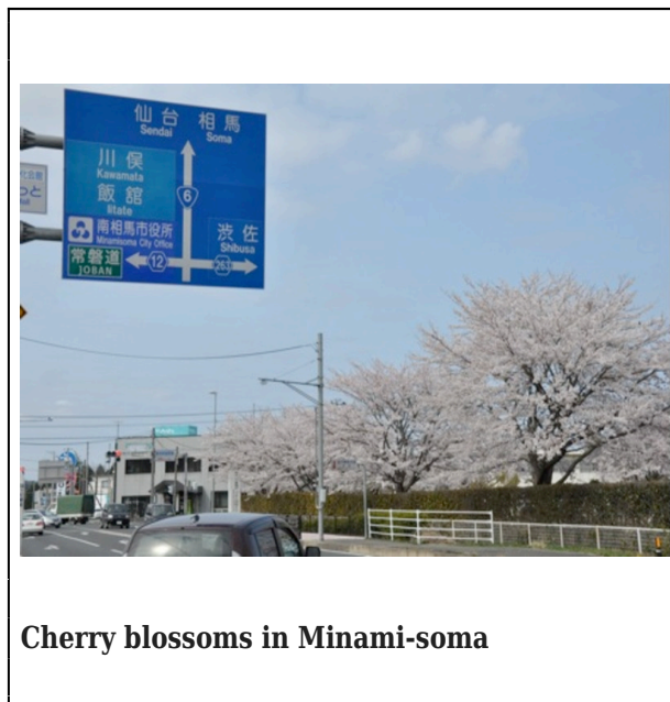
Cherry blossoms in Minami-soma

Even if it were safe, Odaka has other problems: “There is no reconstruction of public facilities and infrastructure, and I wonder how we can make a living there.” There is also growing anxiety over the compensation process among evacuees inside the newly liberated zone. Does this mean that compensation is going to be halted, as many fear?