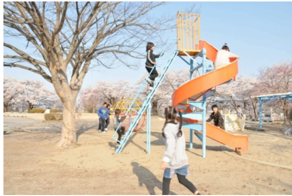
Children at play at Yonomori Park, April 21, 2012 at the peak of cherry blossom viewing

Suzuki Tokiko (64), who lives near the park, detected 0.97 uSv per hour there with her own dosimeter on April 20th. When she informed the city, she says they responded that “The radiation level is low and you can enjoy cherry blossom viewing without problems.”