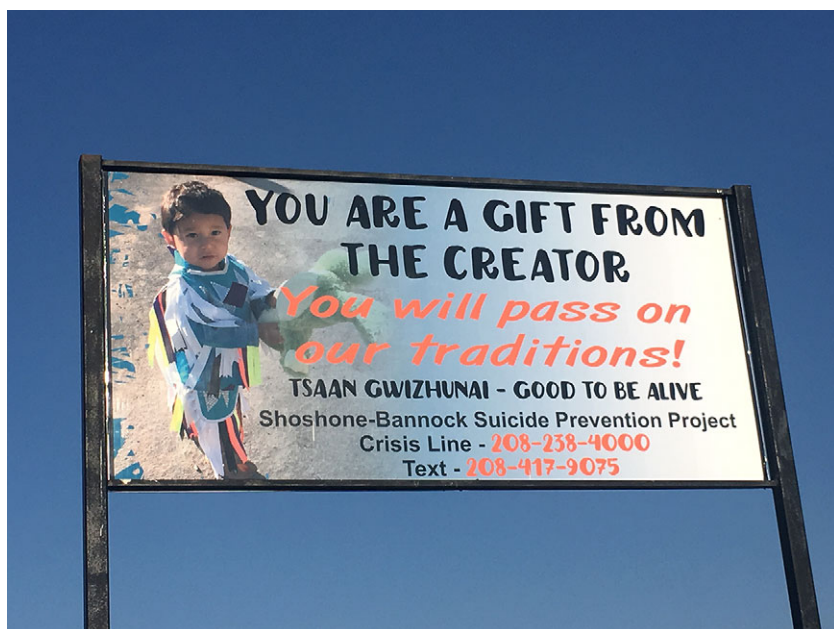
Figure 1.2 Indigenous communities that lose their languages often face a youth suicide problem. Suicide prevention program, Shoshone Reservation, Fort Hall, Idaho.