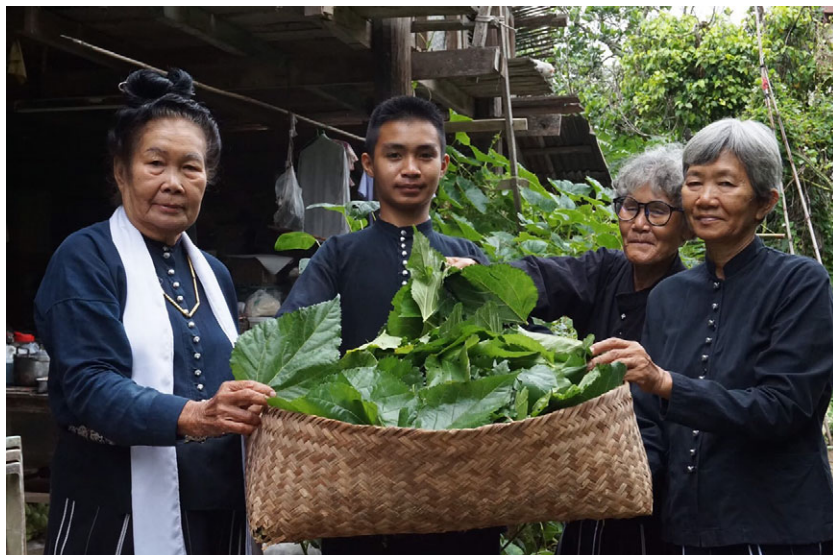
Figure 1.2.2 Linguistic and cultural revitalization program for all generations: Raising silkworm.