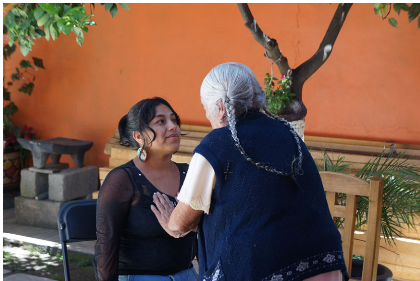
Figure 1.1 Traditional healing knowledge transmitted in Nahuatl. Engaged Humanities project field school, San Miguel Xaltipan, Mexico.

children. This is a core part of cultural transmission that may be lost in contexts where the last native speakers are great grandparents. In addition, there are sacred ritualized uses of language that are found in religious contexts and provide information about the gods, cosmology, and greater spiritual and philosophical questions. In many places, language is used to communicate with spiritual beings, be it a shaman's special language found in many different communities in Siberia, or the use of Hebrew in Jewish religion. Cultural practices thus vary from very elevated to what may be seen as everyday and mundane (see Figure 1.1).