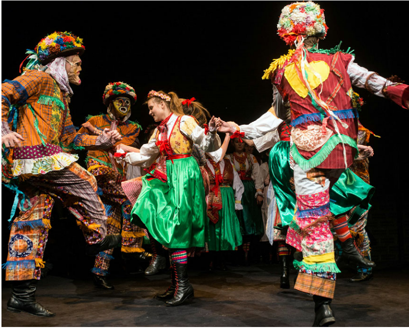
Figure 1.3.1 Performance by the Wilamowianie Dance Group.

What did not help was the attitude of the local authorities, whose officials originated mostly from the surrounding villages, where the distinct Wymysiöeryś culture was derided. Their views were shaped by their upbringing, so discrimination from the 1950s translated into ongoing negativity on the part of the local authorities. The situation would probably have stayed the same until today if the Faculty of ‘Artes Liberales’ of the University of Warsaw had not engaged in revitalization activities. In 2014, the first international conference was organized in Wilamowice – and parts of it were in Wymysiöeryś. It raised the prestige and status of the language among the local inhabitants and authorities, who until then had considered our activities nothing but a flash in the pan. It also fell to us to change the attitude of the oldest generation – some of whom we invited to present on Wymysiöeryś culture and their histories during our various meetings and events. Thanks to this they became aware of the interest in their culture and realized that public use of Wymysiöeryś is not only unpunished, but even welcome. This helped them work through their trauma related to the persecutions.