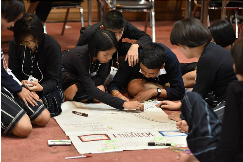
Figure 1.2.1 Revitalization workshop with young people.

community, or sharing stories of their success. The community now talks about their heritage with pride and encourages others to be proud of their own roots as well.