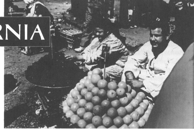
Art is from Between Marriage and the Market