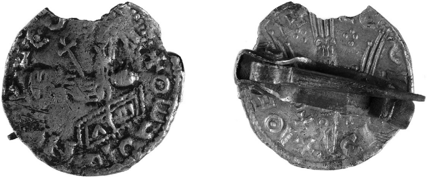
Figure 1: Scandinavian imitation of Agnus Dei type (PAS LON-902122).