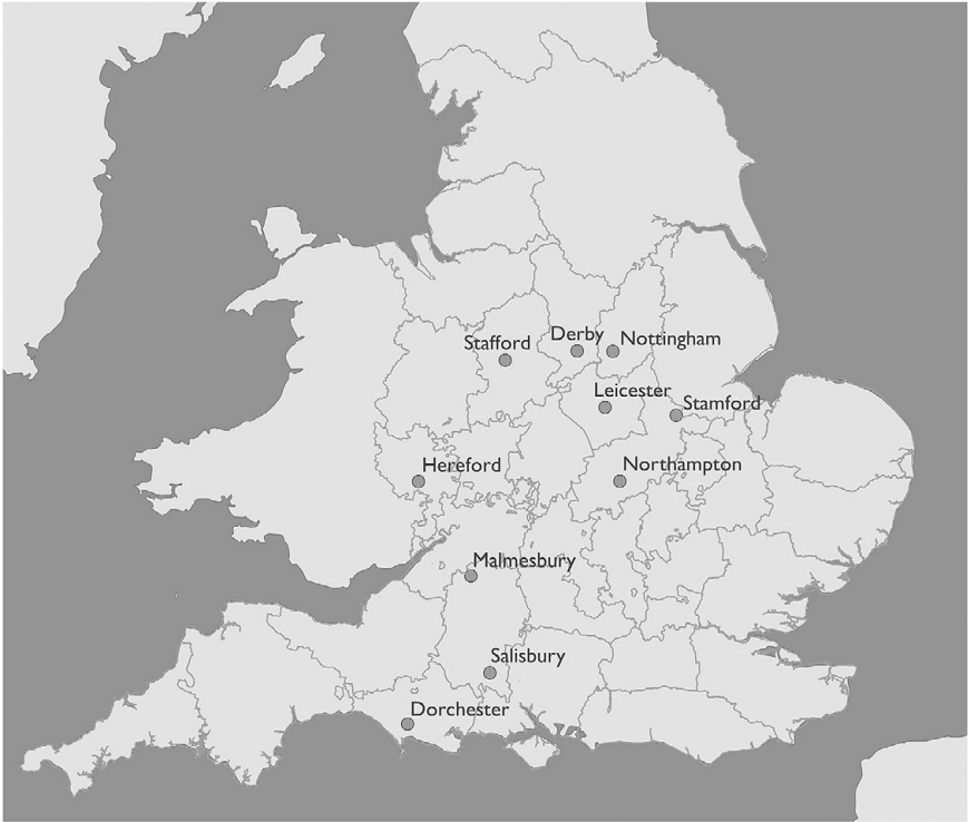
Figure 4: Map of Agnus Dei mint-places, with Domesday shires (using a base map created by Stuart Brookes).

The criteria on which these divisions are based are summarised in Table 3 . This shows why three sharp observers of late Anglo-Saxon coinage could arrive at such different conclusions: there are several patterns of agreement and divergence to weigh against each other. Dolley gave precedence to the shape of the tablet, while Keynes also took into account the presence or absence of ON in the reverse inscription, and it was the discrepancy between these two criteria that led him to leave Derby as a possible member of either group. Blackburn based his proposed structure on a broader range of stylistic affinities, as well as the length of the ethnic element of the obverse inscription; he also looked to regional organisation at the beginning of the next type. 21