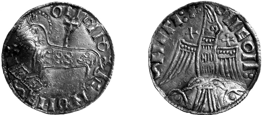
Figure 2: Scandinavian imitation of Agnus Dei type (National Museum of Denmark).