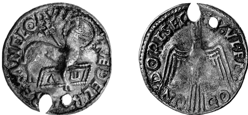
Figure 3: Agnus Dei penny of Dorchester, moneyer Wulfnoth (Spink).

Rev. +FVLFNÐ ON DORCSER around a soaring dove. 8