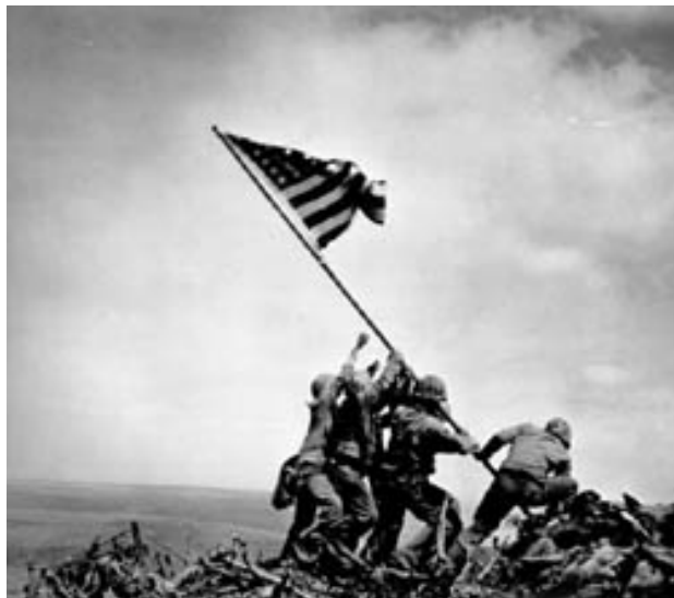
Marines raise flag during battle for Iwo Jima. February 23, 1945

entire 16-acre site to be used for a Memorial, seeing a return to commercial use as a denigration of the memory of those who died (see Blueprint for Ground Zero , New York Times , May 4, 2002). All of the proposals reviewed initially set aside approximately seven acres of the 16-acre site as sacred ground to provide a way to incorporate some tangible reminder of the towers themselves into the memorial design. The remaining 9 acres would be rebuilt as commercial space. The design recently selected, produced by the German firm Studio Libeskind, calls for a 4.5 acre memorial park 30 feet below street level preserving the footprints of both original towers.