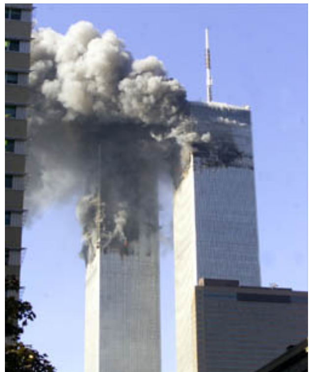
Twin Towers burn after plane attacks

American media coverage of 9-11 and the subsequent war on terror that these events have given rise to a resurgent patriotism in the U.S. not seen since World War II (In this paper I use the American name for the war, World War II). Even in Hawaii, far from the mainland United States, houses along the streets of most neighborhoods routinely display American flags; stores sell flags, pins, and banners; and cars everywhere sport bumper stickers proclaiming national pride and unity. Whether swept up in this renewed patriotism, or worried by the concomitant rise of racism and unchecked militarism, nearly everyone has been affected.