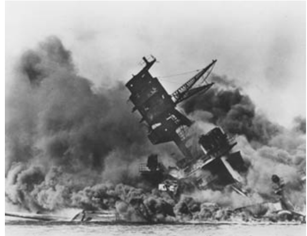
USS Arizona burns after bomb attack

Historians have long noted a certain asymmetry in American and Japanese remembrances of the Pacific War. Whereas Americans have devoted extensive resources to remembering Pearl Harbor, the atomic bombings of Hiroshima and Nagasaki remain problematic, marginal memories (Lifton 1995). In Japan, where war memories in general are more ambivalent and contested than in the U.S., the atomic bombings are, for obvious reasons, a larger focus of national interest. Whereas the official center of American memory of Pearl Harbor is centered on the national monument and shrine constructed over the sunken battleship USS Arizona, efforts to mount even a temporary exhibit of the atomic bombings at the Smithsonian Institution 1995 resulted in deep controversy and cancellation of the exhibit (Linenthal and Engelhardt 1996).