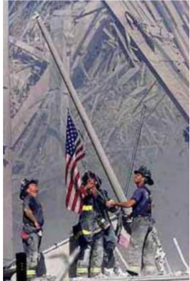
Firemen raise flag in rubble of the World Trade Center. September 11, 2001

Constructing images of patriotic citizenship, of the strong identification of ordinary people with the nation and their willingness to sacrifice themselves for its ideals, has long been the focus for national ceremonies of remembrance. In the United States, such occasions are marked on November 11, Veterans Day, and in the spring on Memorial Day—both days set aside to honor those who have fought (and died) in the nation's wars. To these, we may add Pearl Harbor Day, December 7th and now September 11. Although not a national holiday, Pearl Harbor Day is a national day of remembrance marked with ceremonies and widespread media attention each year.