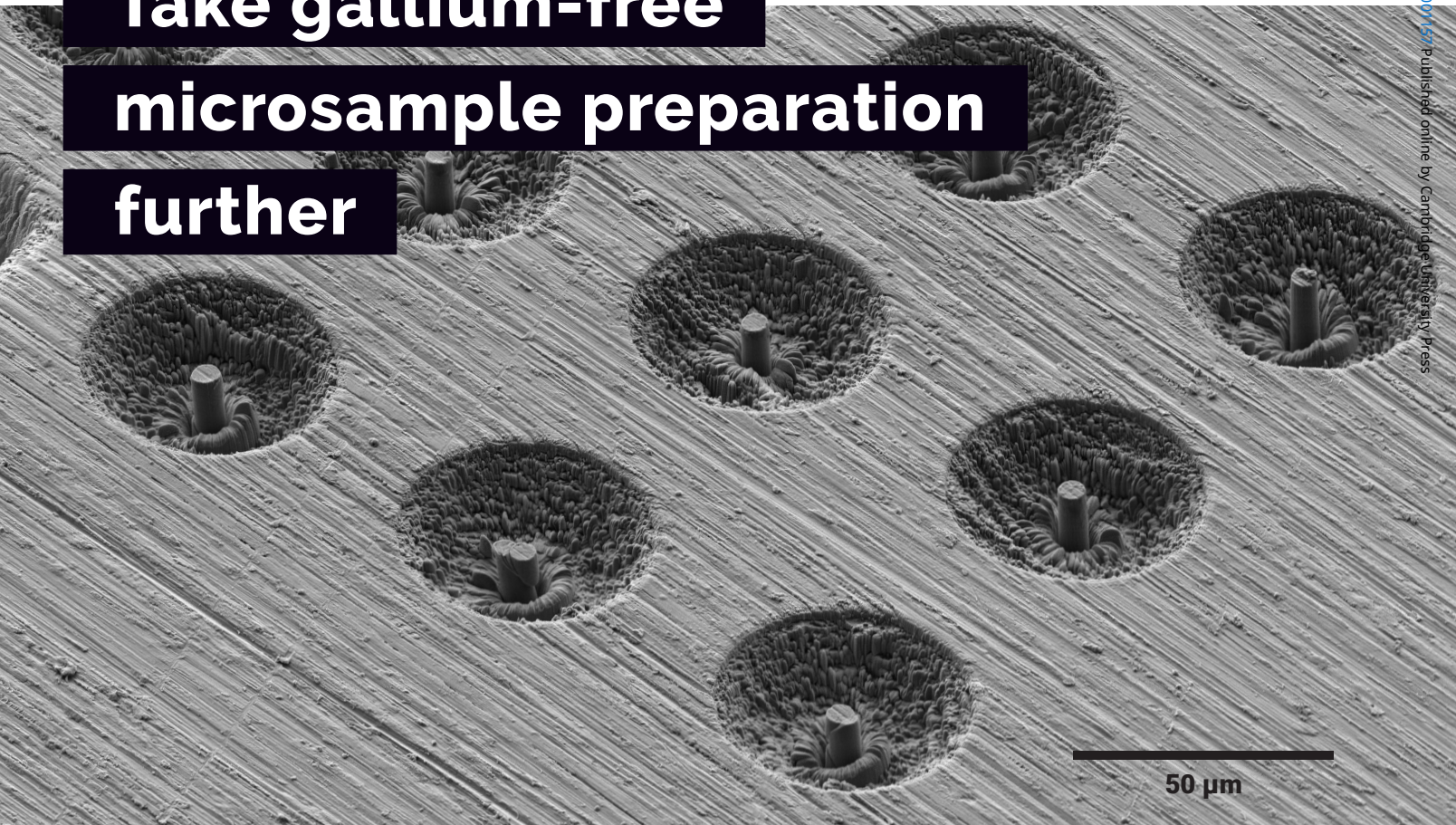
Array of micro-compression test pillars in UFG aluminium alloy