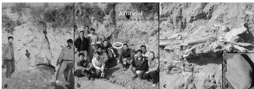
Figure 2 a) The original cliff where a small piece of bone (arrow point) was discovered during a student excursion; b) the students on the field trip. After the cliff was cleaned, large amounts of fossil bones and teeth, ceramics, and artifacts were found (circled area). The dotted line marks the boundary between upper artificial material and the lower original loess-paleosol sequence; c) the fossil bones and teeth of sheep and horses; d) artifact (stone tool) used to smash the bones for marrow.