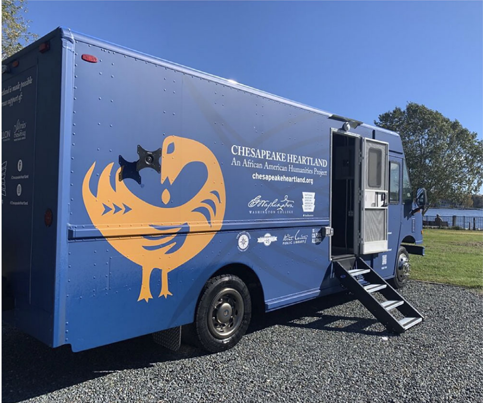
Figure 1. Humanities truck. Image courtesy of Chesapeake Heartland: An African American Humanities Project, Starr Center for the Study of the American Experience, Washington College. Designed by Gordon Wallace.

and future generations. 11 Black Studies traditions were evident at every phase of the project, from raising awareness of the rich Black heritage in Kent County to building an online database of primary sources.